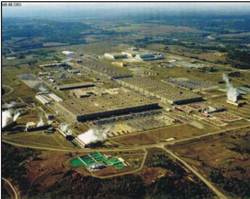
Figure 2-2. Photograph of PORTS from about 1988.