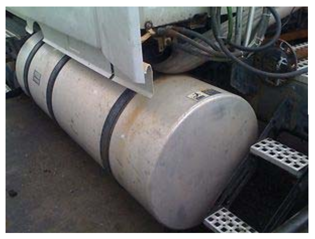
Figure 7. Stock photo of a side mounted fuel tank commonly found in semi-truck designs.

Semi-trucks have two 140 gallon, or greater, diesel fuel tanks, one on each side of the semi. These exposed tanks are at risk for penetration and a resulting fire. A 2012 study of Kentucky motor vehicle collisions found that large trucks are at higher risk for collisions involving fires than passenger cars and pickup trucks.<sup>1</sup> Manufacturers should consider redesigning and relocating fuel tanks on large commercial vehicles to reduce the risk of penetration and fire. Special attention should be paid to increasing the distance that displaced truck components must traverse before coming into contact with the fuel tanks, and to providing protective barriers between the fuel tanks and the frame of the truck.