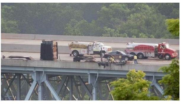
Figure 5. Emergency crews working the scene.

Witnesses stated they felt heat from the fire five lanes away. The police arrived 15 minutes later. The southbound lanes were immediately shut down and crews worked quickly to contain the fire. Once the fire was contained, the response team noticed there was no driver inside the cab of the tractor. A team of fire fighters began searching for the driver.