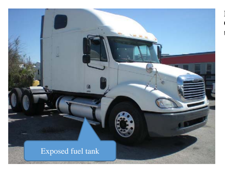
Figure 3. Stock photo of a 2006 Freightliner Columbia 120, similar to the unit involved in this incident.

The equipment was a 2006 Freightliner Columbia 120 with dual side-mounted fuel tanks, one on each side. This type of design has been shown to make the fuel tank more susceptible to explosion during a collision. The truck was not equipped with a standard fire extinguisher.