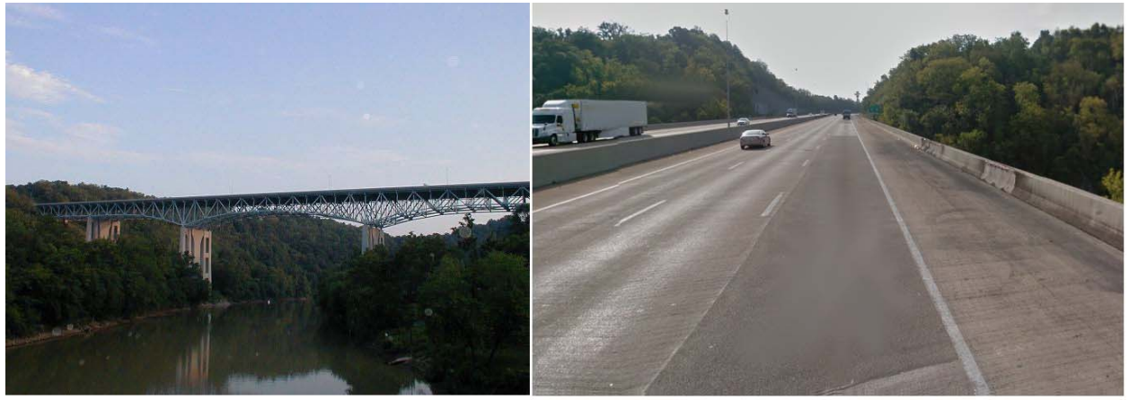
Figure 2. Interstate bridge where the incident occurred.

The incident scene was a southbound six- lane interstate bridge span, 250 feet above a major river. The stretch of roadway was clear and straight with barrier walls on each side and in the middle to divide the interstate. The bridge was lighted for nighttime travel. The tractor trailer was a 2006 Columbia 120 Freightliner.