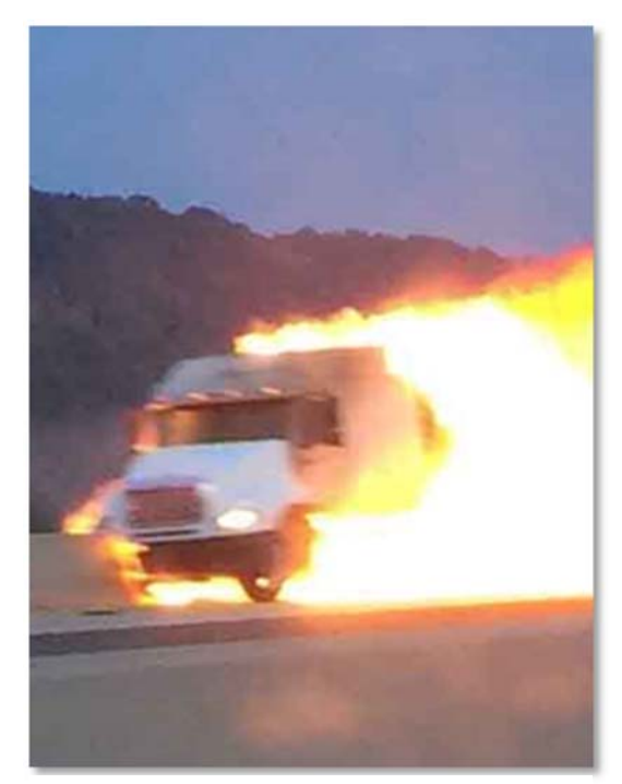
Figure 1. The semi-truck engulfed in flames following the incident.

Though there were no direct witnesses, it is believed the driver exited the passenger side window to escape the fire, and fell to his death over the concrete barrier wall. He was discovered by fire fighters 170 feet below the bridge in a steep wooded area. The victim was pronounced dead at the scene.