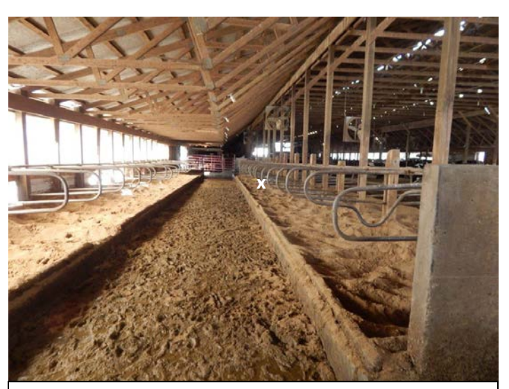
Figure 2. Freestall barn area leading to dairy milking parlor

The incident occurred at approximately 2:00 p.m. At the time, the dairy used a de-horned natural service bull to impregnate the cows. The owner indicated that since not all cows conceive with (take to) artificial insemination they have one bull that roams with the cows. The 2-year-old bull had been hand-raised by the family and their farm workers. The owner indicated the bull had never shown any behaviors aggressive toward the owner's family or the hired farm workers. The bull was allowed to routinely mix with the cows, both outside and inside of the barn.