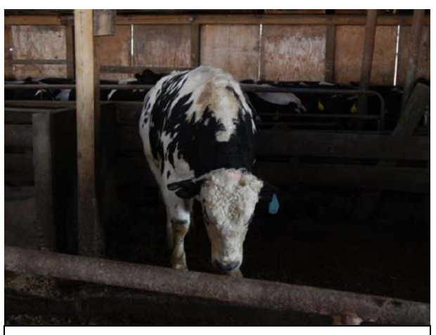
Figure 1. Bull which may have been involved in the incident

In spring 2014, a dairy farm worker in her 40s was mauled by either a 2-year-old bull or a dairy cow. The farm worker was herding approximately 50-60 dairy cows from a freestall area (where the cows eat and stay when not being milked) into a holding pen before they enter the parlor for milking. The bull had been raised by the owner's family on the farm and freely roamed with the dairy cows. The event was unwitnessed. The owners of the farm and a family member were in the front of the barn; one of the owners was tending to a sick cow and the other owner and family member were in the yheard the cows bellowing. The three of them stepped