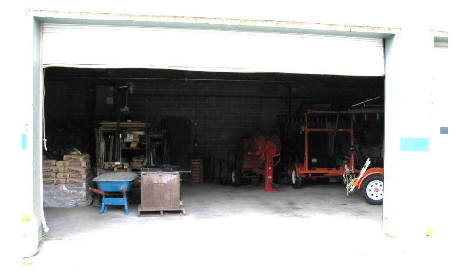
Figure 2 – Incident location with overhead garage door open