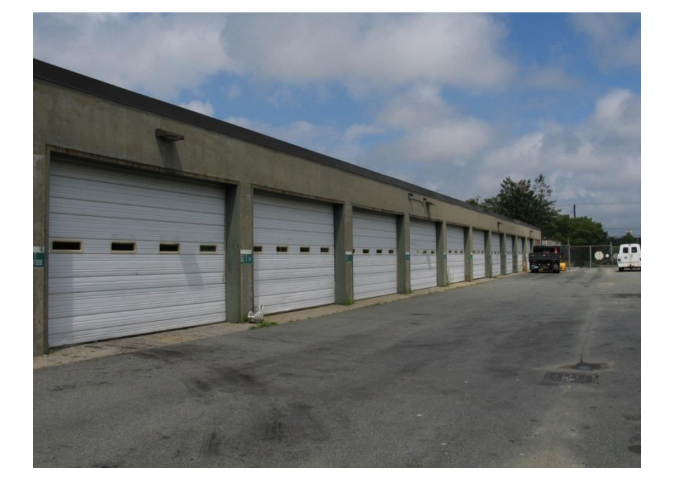
Figure 1 – Storage area where incident occurred

5. General Laws of Massachusetts, Title XXI, Labor and Industries, Chapter 149: Section 6. Safety devices and means to prevent accidents and diseases generally; fees for structural painting.