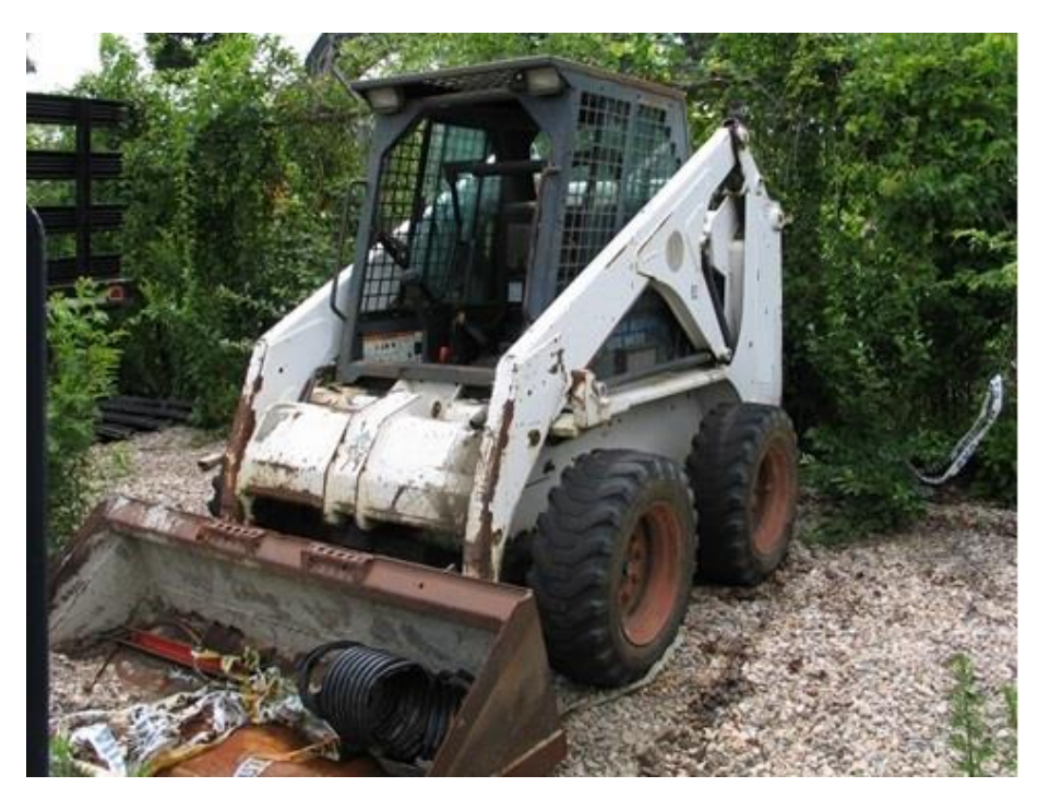
Figure 3 – Skid-steer loader involved in the incident