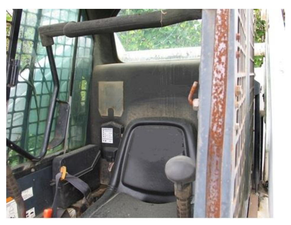
Figure 4 – Skid-steer loader's seat bar and lever controls