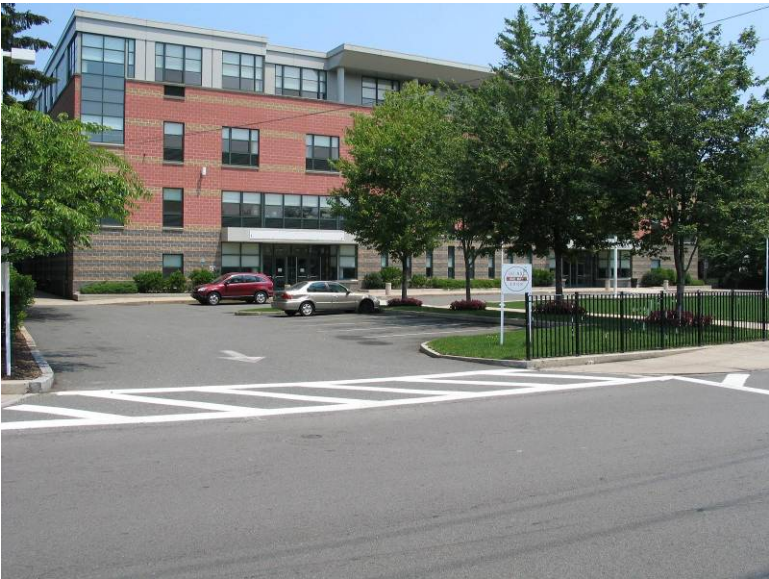
Figure 5 – Incident location with vehicles parked on both sides of the crosswalk