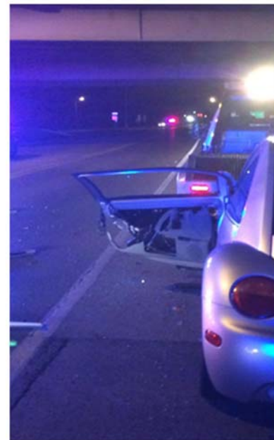
Figure 1. Tow truck and Volkswagen Beetle at the scene.

On Thursday night, July 3, 2014, a 35-year-old tow truck driver and his 31-year-old male driver trainee arrived on the scene to assist a 1998 Volkswagen Beetle driver who needed his vehicle to be towed. The tow truck driver parked his towing unit in front of the Volkswagen Beetle on the eastbound shoulder of the roadway. The victim was operating the lift controls on the traffic facing side of the tow truck, when a 2002 Toyota Corolla struck the open driver's side door of the Volkswagen, then struck the tow truck driver and the side mirror on the tow truck. The Toyota Corolla driver continued driving, while the Volkswagen driver called Emergency Medical Services. EMS arrived within four minutes and attempted to resuscitate the victim. The time of death was called at 11:54 pm at the scene.