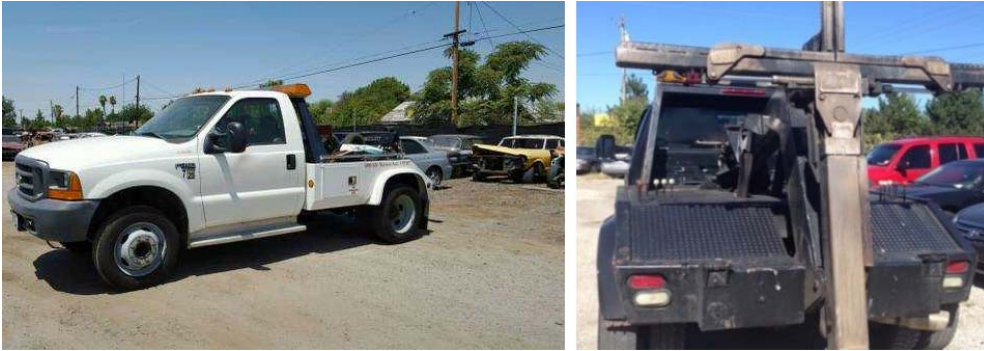
Figure 3. Stock images of a Ford F450 tow truck (this is not the exact unit involved in the incident).

The tow truck was a 1999 Ford F450 wheel lift tow truck (2 axle, 6 tires). The truck was equipped with dual winch controls on both sides of the truck for towing purposes. It is unknown if both winch controls were operational. The tow truck was equipped with a light bar with flashing LED warning lights and working lights.