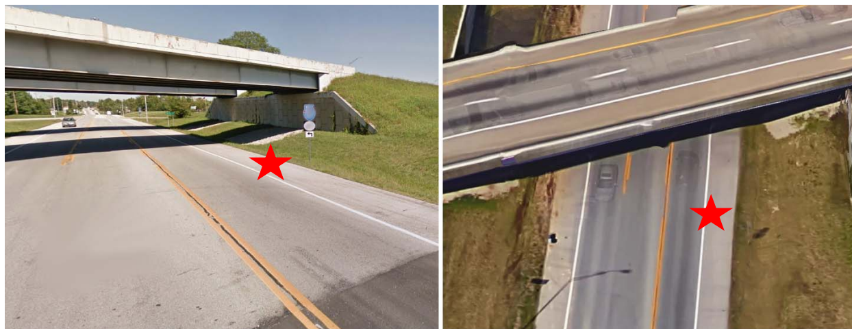
Figure 2. Ground and aerial view of the incident scene. The red star denotes approximately where the driver was standing upon being struck.

The incident scene was the eastbound lane of a two-lane state highway with a central turning lane dividing the two sides. Located just under a 4-lane highway overpass, the road was partially illuminated with streetlights. The roadway was straight, level and dry. The tow truck was parked 2-3 feet from the driving lane. The victim was on the right shoulder of the highway near the lift controls on the left-hand side of his truck. Directly behind the tow truck on the shoulder was a stalled Volkswagen Beetle in need of roadside assistance.