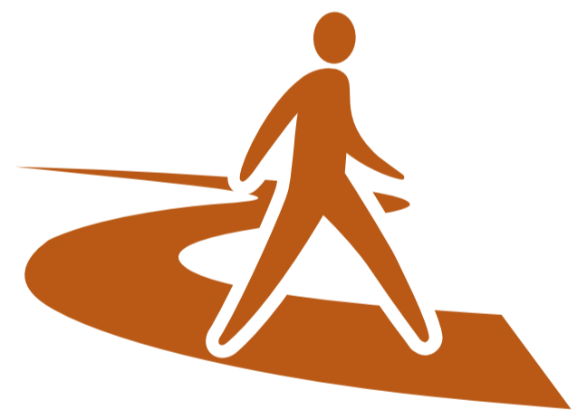
Lack of Physical Activity

6 in 10 Americans live with at least one chronic disease 1