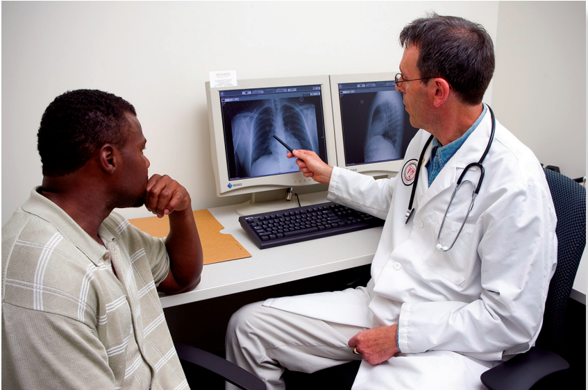
A chest x-ray may show if you have TB disease.