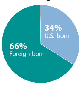
Figure 3. Proportion of TB Cases by National Origin, 2014