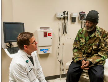
Screening baby boomers in emergency department finds those infected with hepatitis C and links them to care and treatment.

week of the positive diagnosis, the program links the patient to a physician and follow-up appointment with the UAB liver clinic for treatment and care.