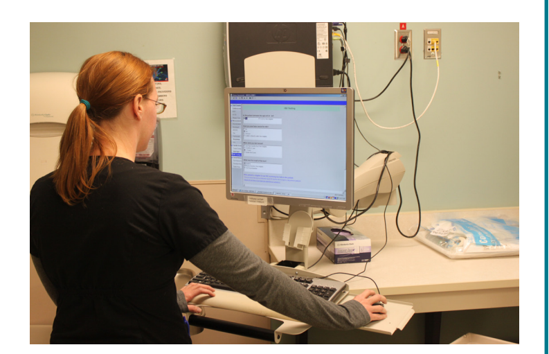
Emergency department medical staff.

For more information on hepatitis C, please visit: www.cdc.gov/knowmorehepatitis