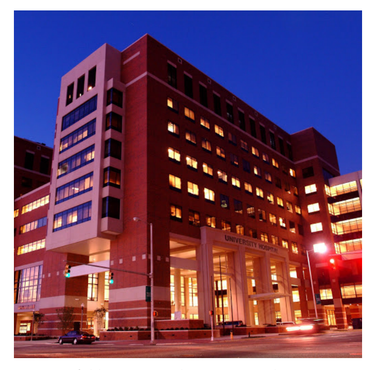
University of Alabama at Birmingham (UAB) Hospital.