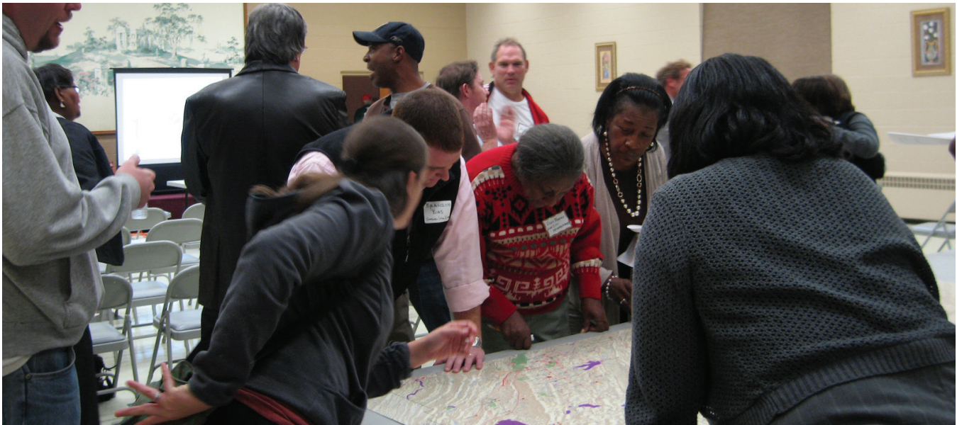
Community residents in Jefferson County, AL engage in development of the Red Rock Ridge and Valley Trail System Master Plan.