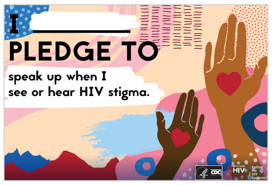
Brochures, palm cards, pledge cards, and posters