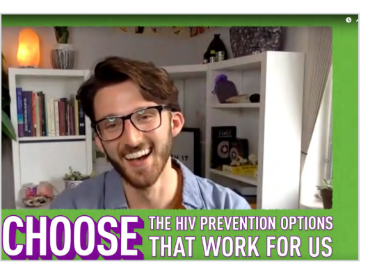
Public service announcements