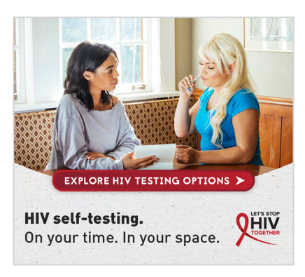
Web banners and buttons