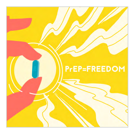
Social media toolkits

Let us help you use the Let's Stop HIV Together campaign to reach specific audiences and communities. Health departments and organizations can co-brand the campaign materials and we can provide your organization direct technical assistance and advice on how to maximize your use of the campaign. For more information, please email <u>StopHIVTogether@cdc.gov</u>. Your request will be routed to appropriate staff. Below are examples of some of our toolkits and hundreds of materials ready to use.