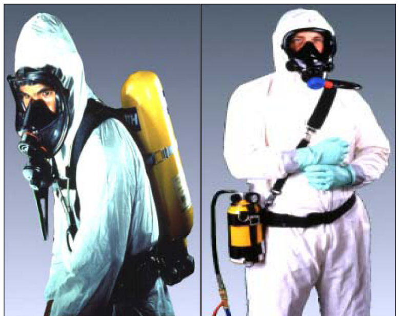
Two examples of full-face atmosphere-supplying respirators. The system on the left is a full-face, pressure demand respirator with a self-contained breathing apparatus. The system on the right is a combination full face piece, pressure demand atmosphere-supplying respirator with an auxiliary self-contained air supply.

When engineering and work practice controls cannot decrease methylene chloride levels below OSHA's PELs (25 ppm over an 8-hour TWA or 125 ppm over a 15-minute period), employers must provide their workers with full-face atmosphere-supplying respirators. Air-purifying respirators are not permitted due to the short service life of chemical cartridges when used for methylene chloride exposure. Half-mask respirators may NOT be used because methylene chloride may cause eye irritation or damage. Whenever respirators are required to be worn, the employer must establish and implement a complete respiratory protection program that meets the requirements of OSHA's Respiratory Protection standard (29 CFR 1910.134), including proper selection, usage, training and medical surveillance.