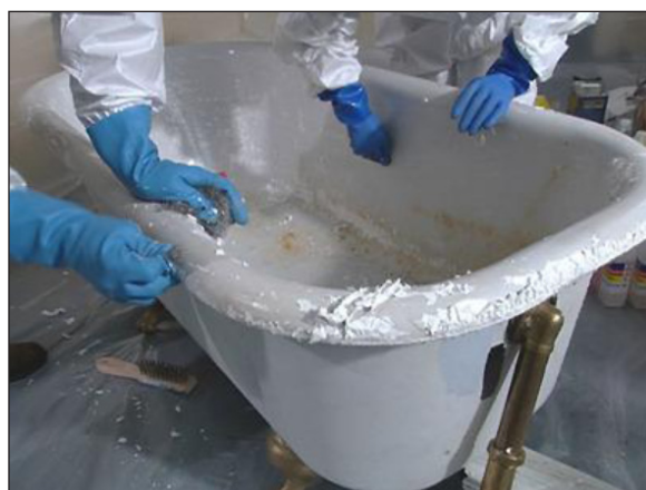
Workers use a methylene-based stripper to remove paint from a bathtub prior to refinishing.

Methylene chloride, a chlorinated solvent, is a volatile, colorless liquid with a sweet-smelling odor. It is often referred to as dichloromethane. Methylene chloride has many industrial uses, such as paint stripping, metal cleaning and degreasing.