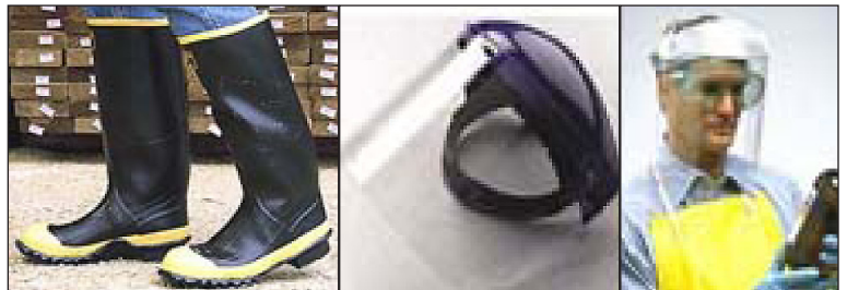
Images from left to right: methylene chloride-resistant boots, face shield, and worker wearing a methylene chloride-resistant apron, safety goggles and a face shield.