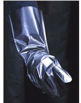
Laminate gloves resist methylene chloride from coming through.