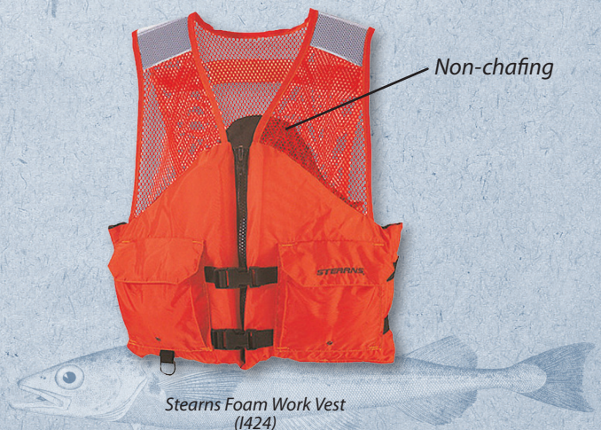
Stearns Foam Work Vest (1424)