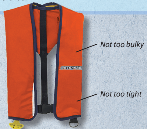
Stearns Inflatable Suspenders (1339)