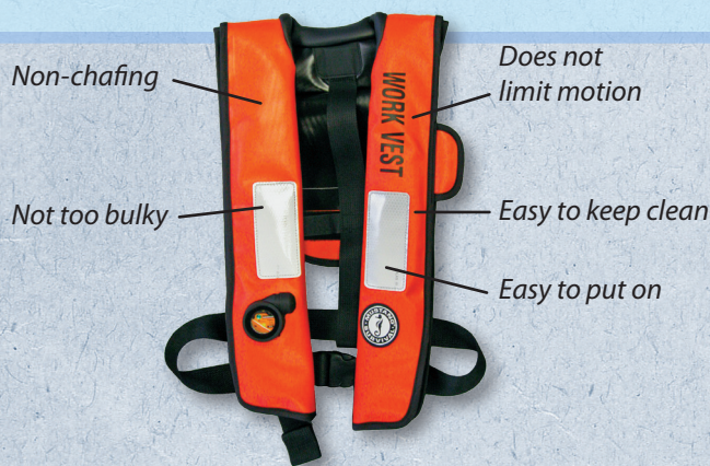
Mustang Inflatable Suspenders (MD3188)

After the 30 day on deck evaluation of PFDs, trawlers preferred Mustang and Stearns Inflatable Suspenders, the Stearns Foam Work Vest, and the Regatta Raingear with foam in the bibs.