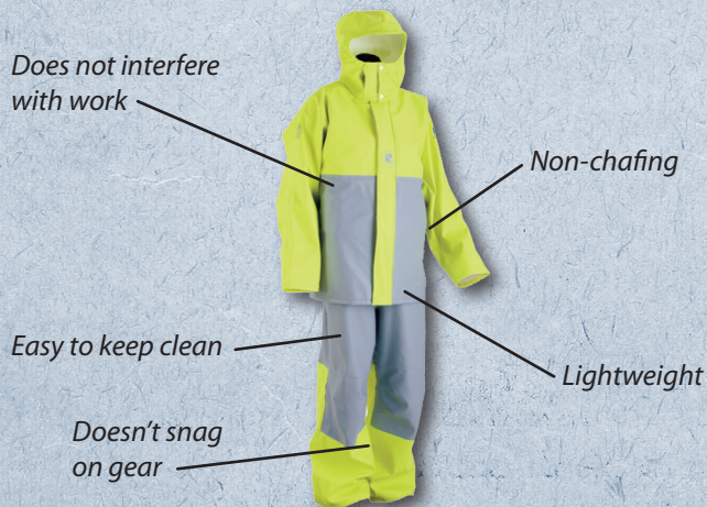
Regatta Fishermen's Oilskins with Flotation