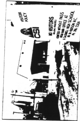
Federal health officials on Wednesday said that CSI posed a serious health threat to its former workers.

The CSI incinerator burned waste from 1977 until 1988. During that time, state environmen-