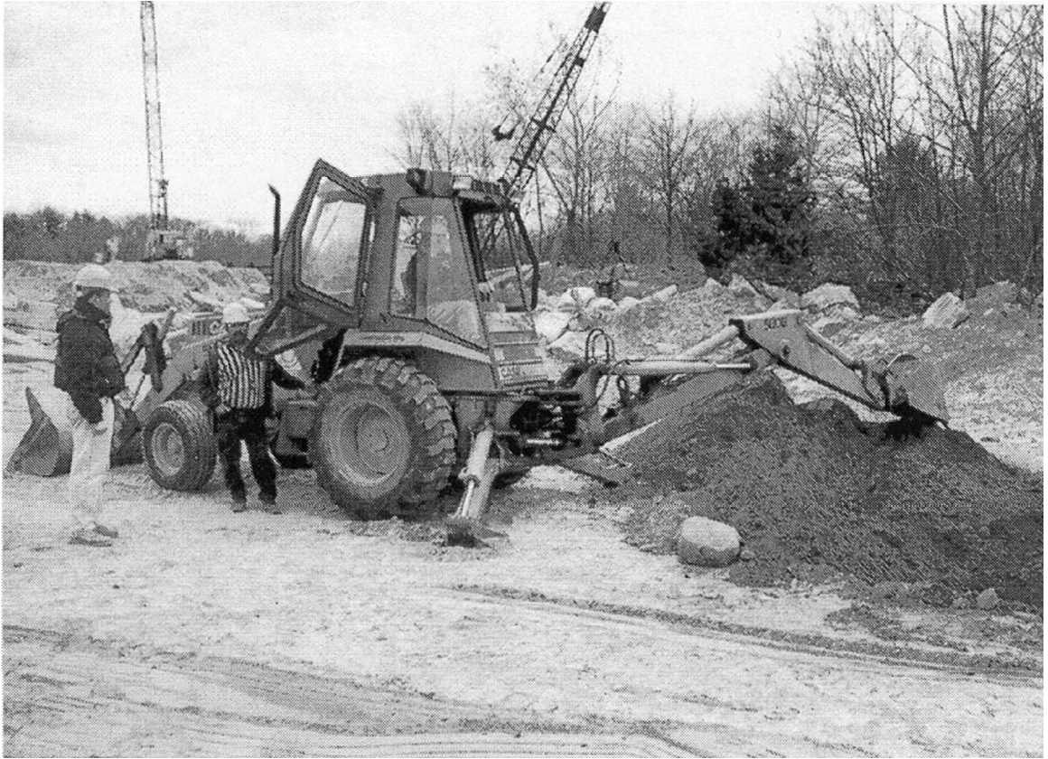
FIGURE 1 A Case Super 580E Backhoe/Loader.