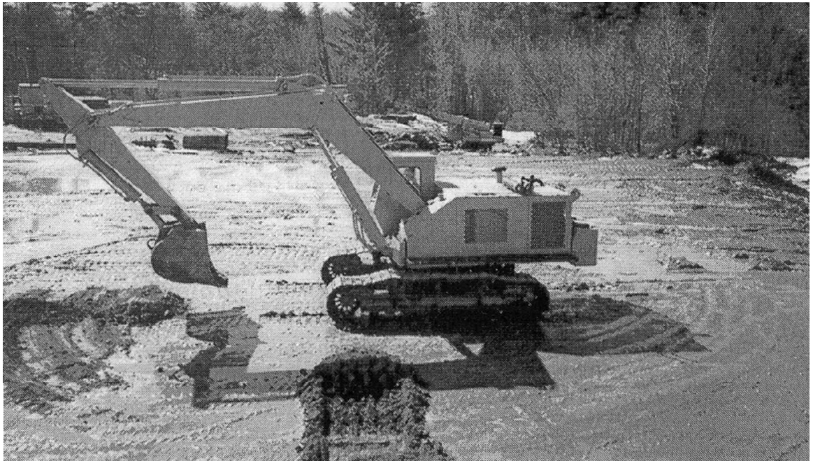
FIGURE 2 An Insley H-2000 Excavator.