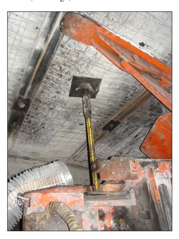
Figure 4.—Once drilling is completed, the CDSE is moved aside so the roof bolt can be installed.

<u>JPeterson@cdc.gov</u>) or Lynn A. Alcorn (412-386-6732, <u>LAlcorn@cdc.gov</u>), NIOSH Pittsburgh Research Laboratory, P.O. Box 18070, Pittsburgh, PA 15236-0070.