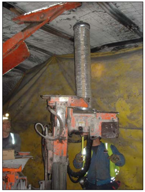
Figure 2.—The CDSE is now flush with roof.

For more information on the CDSE for reducing noise exposure, contact J. Shawn Peterson (412-386-4995,