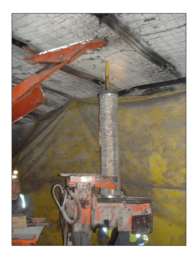
Figure 1.—The CDSE at the start of drilling. The gap above the CDSE allows the operator to see the drill bit/media interface to start the hole. The height of the CDSE can be varied to suit the particular application.

Laboratory testing in a reverberation chamber (for sound power level) and hemianechoic chamber (for noise source identification and operator ear sound pressure level) showed that