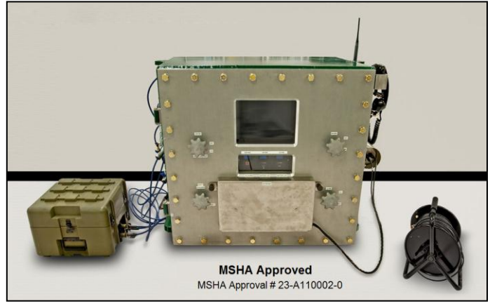
Figure 2. MagneLink® Magnetic Communications System.

This underground system was designed to be installed in a fixed location perhaps near a refuge alternative or other strategic location underground.