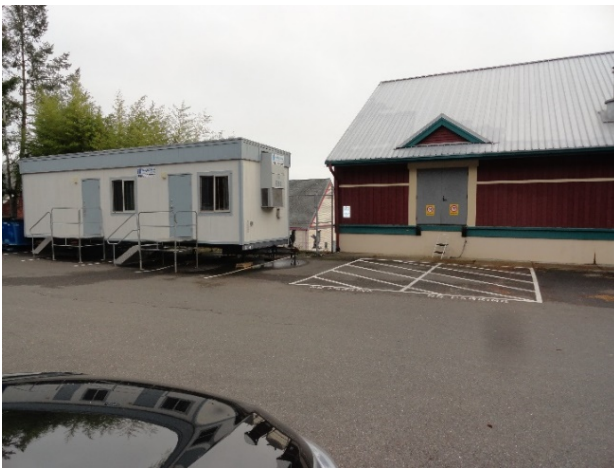
Figure 1. Temporary trailer located outside of elephant barn used as office space by elephant barn employees for administrative activities.

If the exhaust fan in the hay storage area is not routinely used, consider deactivating the power switch to prevent use.