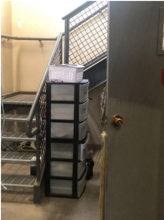
Figure 3. Personal protective equipment storage and donning and doffing station in the first-floor entryway to the elephant barn.