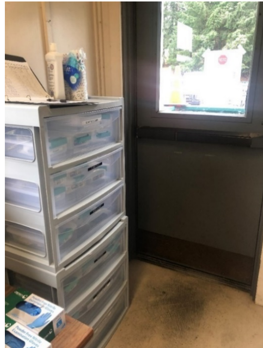
Figure 4. Personal protective equipment storage and donning and doffing station at the upper level employee entrance to the elephant barn.