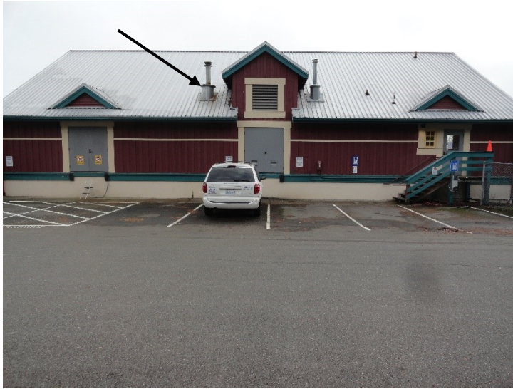
Figure 2. Exhaust air louvers above employee parking lot.