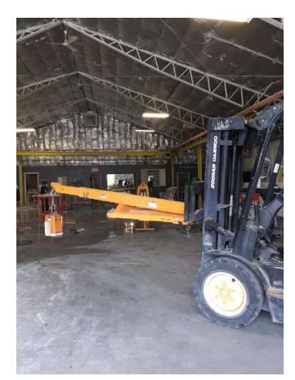
Figure 1 – The forklift inside the shop with the boom and slab lifter attached.

The telescoping boom attachment consisted of two rectangular steel tube sections. Specifications from the manufacturer indicated the boom weighed 286 pounds, had a maximum rated load capacity of 3,300 pounds when fully retracted, and a maximum load capacity of 1,320 pounds when fully extended. The telescoping range of the boom was from approximately 6.8 feet to 11.7 feet in three increments of 19 inches. The boom could only be extended manually and had a series of pins and clips to hold it in position. The boom attached to the forklift by sliding onto the forklift tines and was secured by two bolts and two restraint pins (Figure 1).