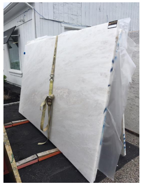
Figure 4 – The marble slab involved in the incident.