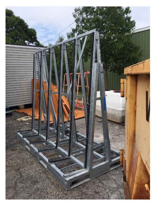
Figure 3 - A-frame rack involved in the incident without the caster wheels attached and the safety posts not installed.

An A-frame rack was in use at the time of the incident and was designed to hold slabs in a range of sizes (Figure 3). The rack was equipped with removable caster wheels that were in place at the time of the incident. The caster wheels consisted of 8-inch diameter roller bearing wheels that were rated at 2,000 pounds each. Two of the four wheels were swivel casters with brakes and the other two wheels were rigid. The rack's rated capacity was 8,000 pounds, 4,000 pounds for each side of the rack with the installed wheels (it had a 10,000 pound capacity, 5,000 pounds per side, without the optional wheels installed). The rack was equipped with four hold-down ratchet straps to secure the slabs being stored on the rack. It was also equipped with four safety posts, two for each side, to prevent a slab from tipping off the rack and provide safe access of unstrapped loads that may shift unexpectedly. The rack was 96 inches long by 28 inches wide and 99 inches high (88 inches high without the optional caster wheels).