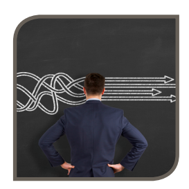
Risk Assessment Methods & Systematic Review