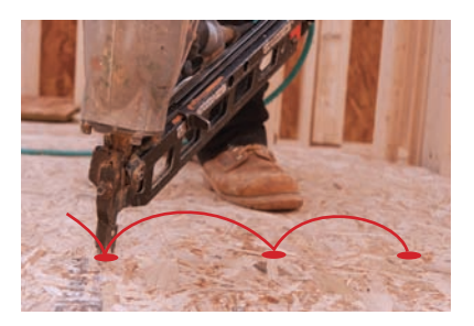
Bump firing or bounce nailing is using a nail gun with a contact trigger held squeezed and bumping or bouncing the tool along the work piece to fire nails. Red dots show path of motion.