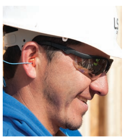
Worker using recommended PPE when working with nail guns: hard hat, safety glasses, and hearing protection