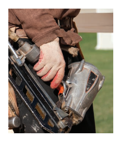
Common nail gun grip with finger on trigger