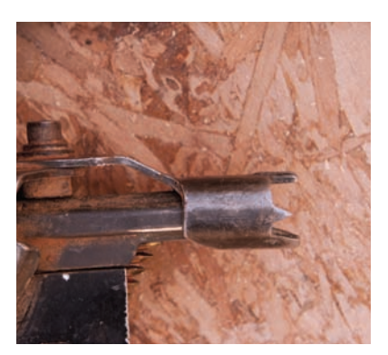
Contact safety tip