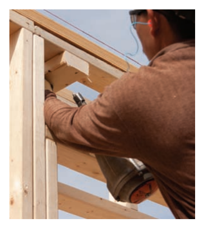
Nail penetration through the lumber is a special concern where the piece is held in place by hand