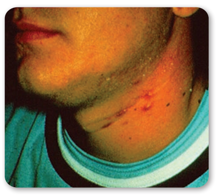
Images illustrating skin injuries and diseases were selected from Occupational Dermatoses—A Program for Physicians. Additional information about this slideshow is available at http://www.cdc.gov/ niosh/topics/skin/occderm-slides/ocderm.html.

Temporary adverse health impacts may occur from exposure to chemicals. For example, it is not uncommon to experience dry, red, cracked skin from contact with water, soaps, gasoline, and certain types of solvents. These disorders usually heal quickly when the skin is no longer in contact with the chemical, but they can increase the chance of infection when breaks in the skin are present.