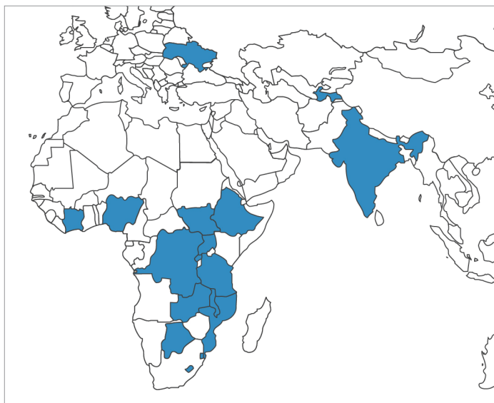
Table 1 (below) presents findings from drug resistance surveillance studies conducted between 2020 and 2022. Clinic-based surveys were conducted in Malawi and Mozambique. Lab-based surveys utilizing CADRE were conducted in Uganda and Ukraine. The surveys provide data to understand levels of drug resistance to DTG-based regimens. Findings indicate that the percentage of patients experiencing clinically significant resistance to DTG-based regimens is low, indicating that DTG-based regimens remain effective for the majority of patients with a high viral load.

CDC is helping build capacity for surveillance, strengthening laboratories, and leading the implementation of CADRE in 15 countries, with support from PEPFAR (Figure 1, right).