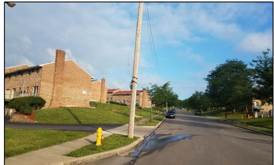
Lighting poles along street