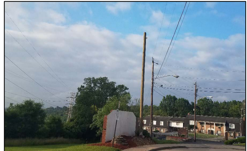
New camera pole at end of cul-de-sac