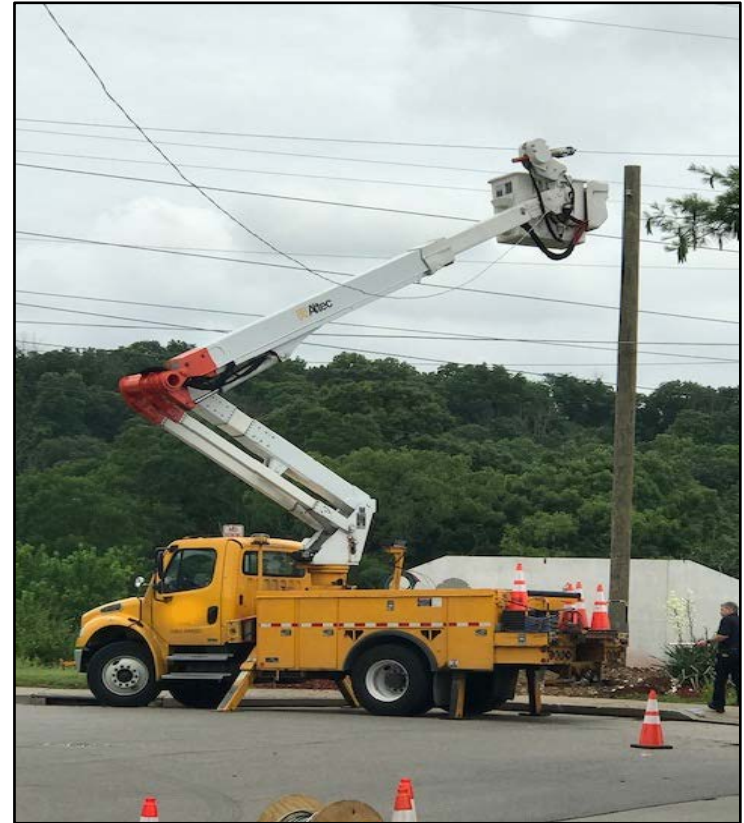
Position of bucket truck in cul-de-sac at the time of the incident.