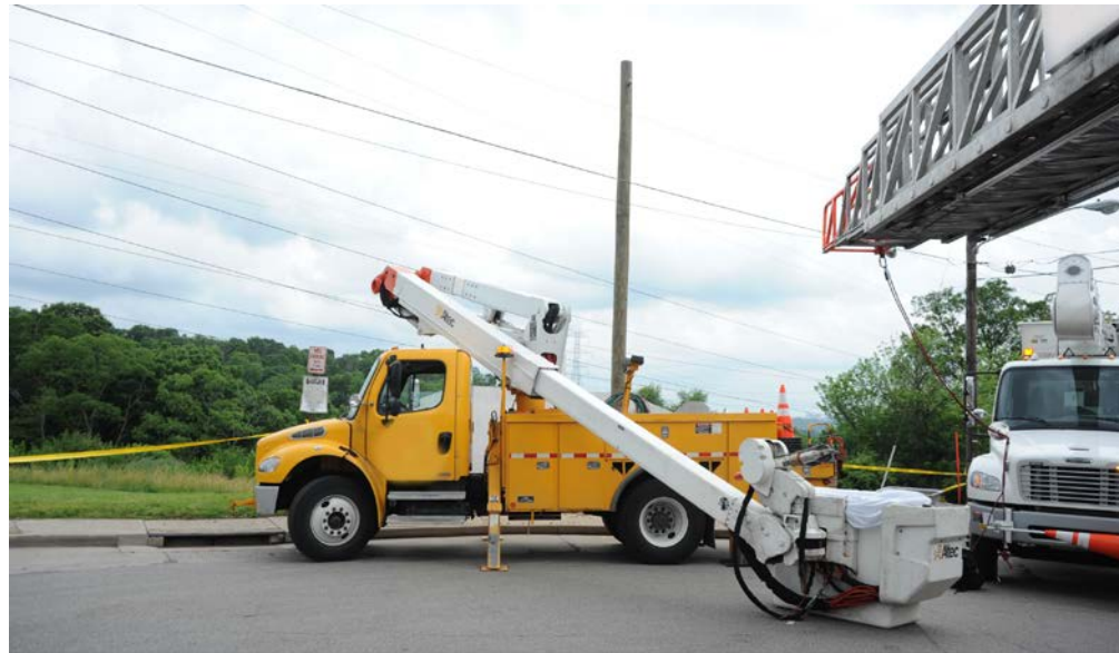
Freightliner M2 Aerial Lift Boom Truck