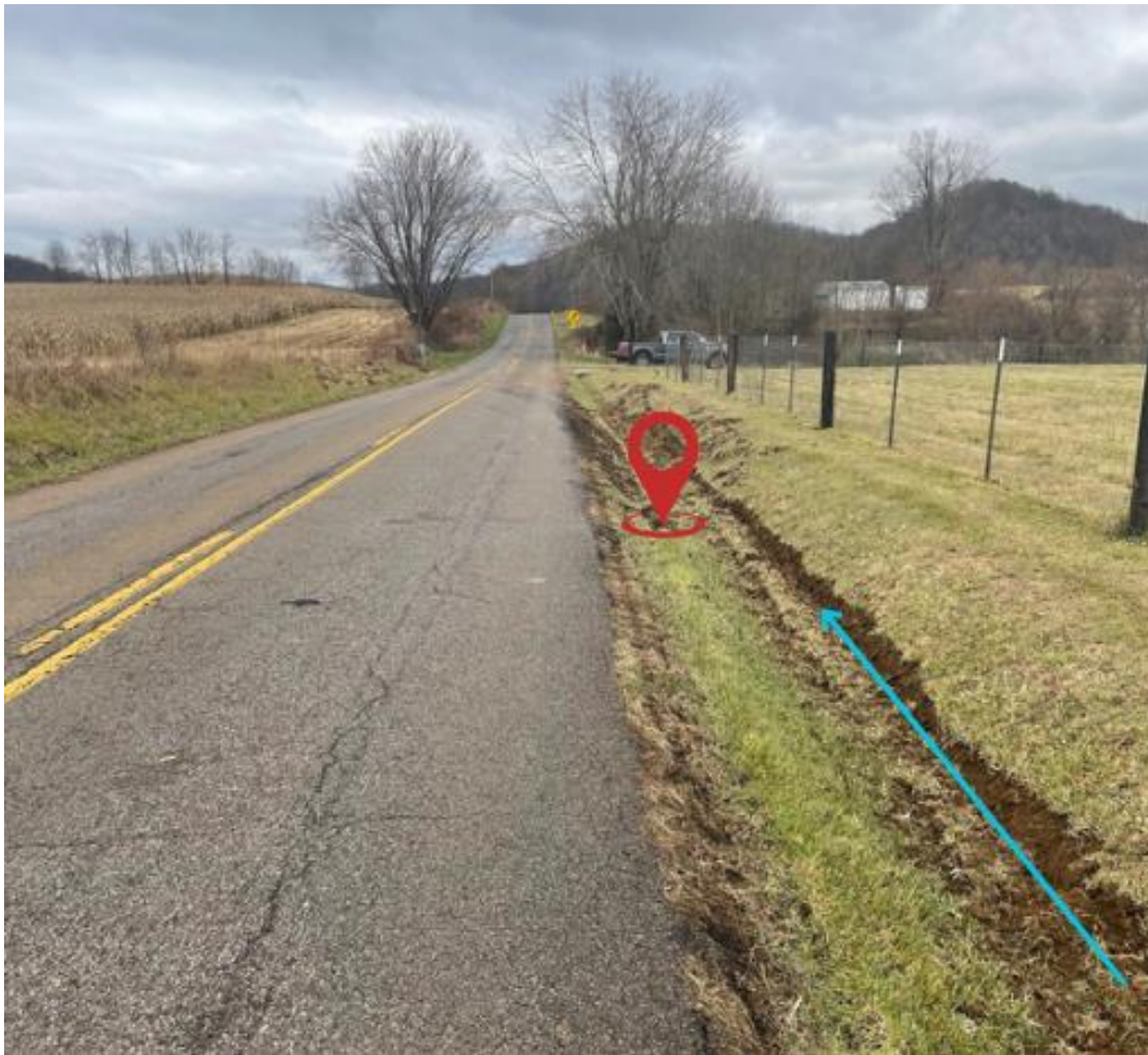
Photo 6. The red location marker indicates the point where the driver attempted to steer the truck back onto the highway. The blue arrow indicates the path made by the passenger side trailer tires as they were drawn into the ditch from the overcorrection and weight shift.

Kentucky Injury Prevention and Research Center Bona fide agent for Kentucky Department for Public Health 333 Waller Avenue, Suite 242 • Lexington, KY 40504 • 859-257-5839