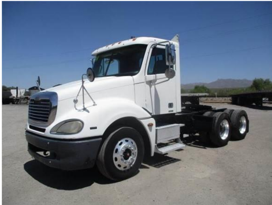
Photo 3. Google image depicting make/model of the semi-truck involved in crash.

Kentucky Injury Prevention and Research Center Bona fide agent for Kentucky Department for Public Health 333 Waller Avenue, Suite 242 • Lexington, KY 40504 • 859-257-5839