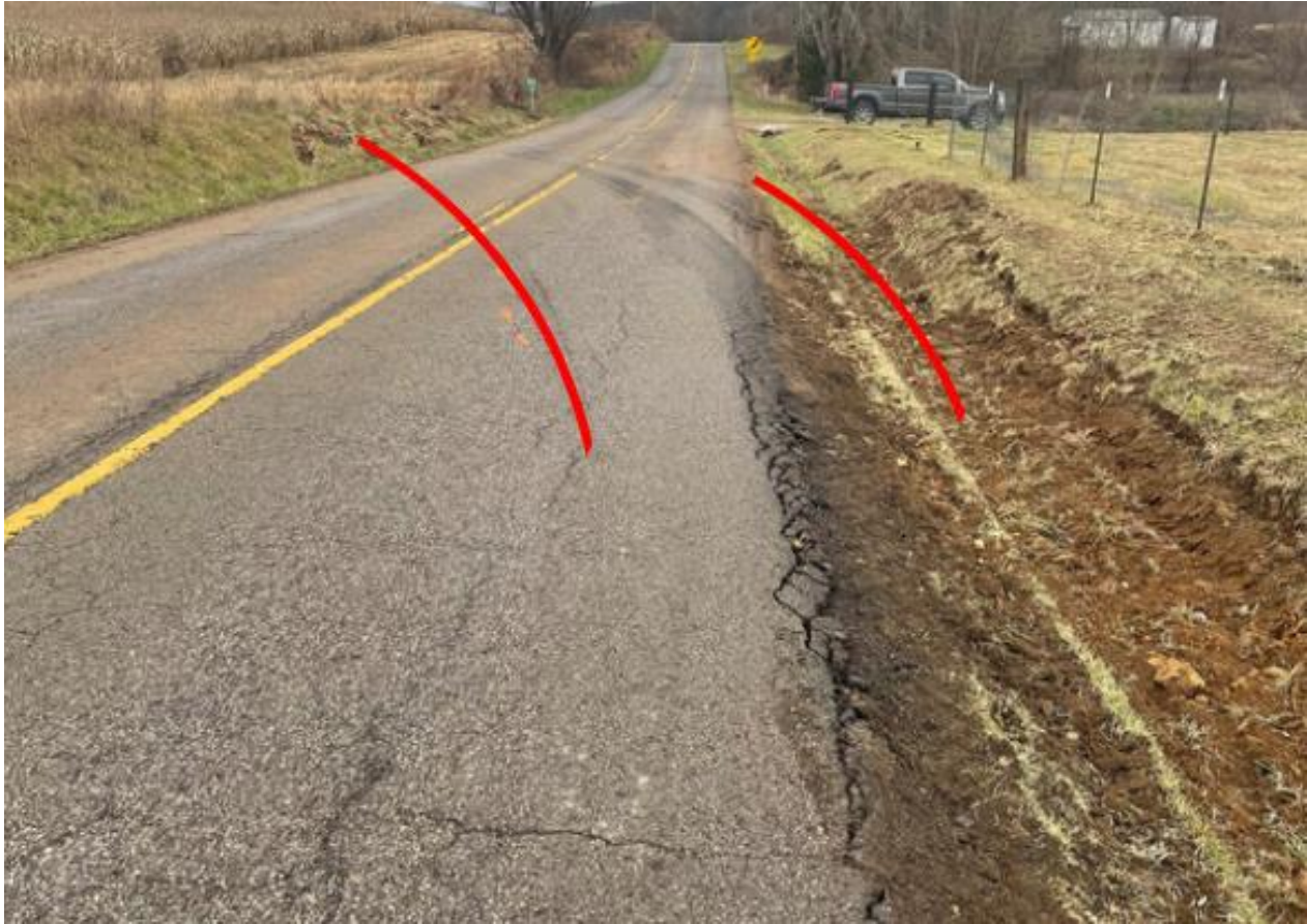
Photo 7. Photo indicating the path the semi-truck traveled as it reentered the roadway and crossed both north and southbound lanes of travel.

Kentucky Injury Prevention and Research Center Bona fide agent for Kentucky Department for Public Health 333 Waller Avenue, Suite 242 • Lexington, KY 40504 • 859-257-5839