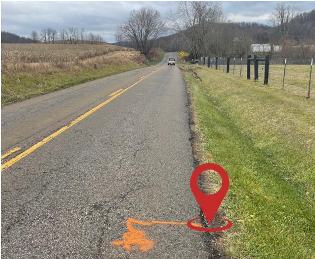
Photo 5. Photo indicating the point where the front passenger side steer tire dropped off the travel portion of the highway onto the shoulder.

Kentucky Injury Prevention and Research Center Bona fide agent for Kentucky Department for Public Health 333 Waller Avenue, Suite 242 • Lexington, KY 40504 • 859-257-5839