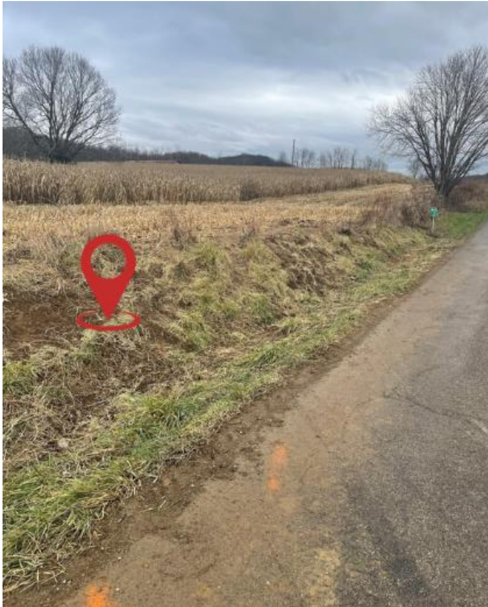
Photo 9. Photo showing the earth embankment struck by the involved semi-truck.

Kentucky Injury Prevention and Research Center Bona fide agent for Kentucky Department for Public Health 333 Waller Avenue, Suite 242 • Lexington, KY 40504 • 859-257-5839