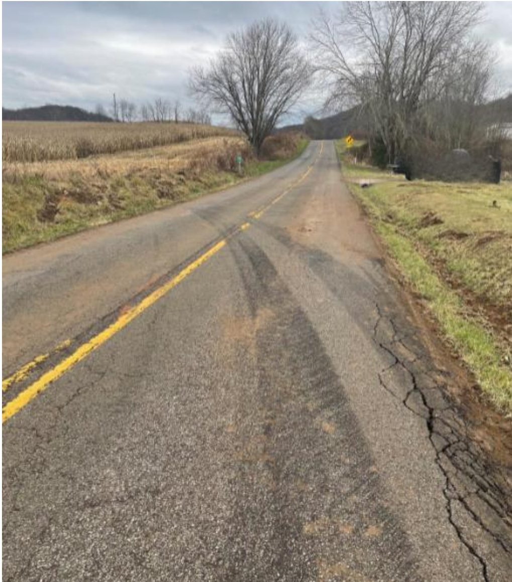
Photo 2. Photo showing the two-lane state highway where the motor vehicle crash occurred.

Kentucky Injury Prevention and Research Center Bona fide agent for Kentucky Department for Public Health 333 Waller Avenue, Suite 242 • Lexington, KY 40504 • 859-257-5839