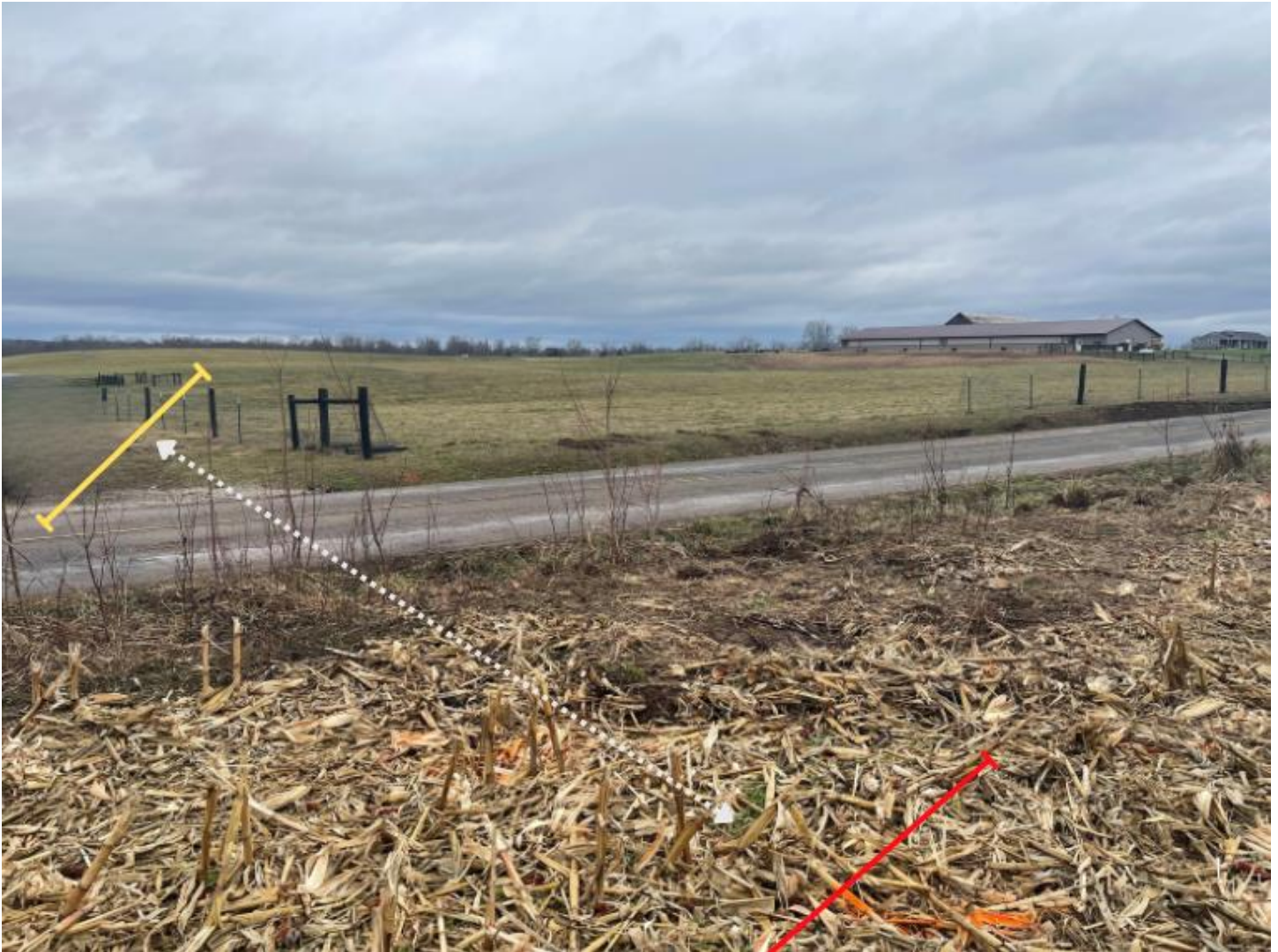
Photo 10. Photo showing the final resting location of the semi-truck and trailer. The red line indicates the front of semi-truck. The yellow line represents the rear of the trailer.

Kentucky Injury Prevention and Research Center Bona fide agent for Kentucky Department for Public Health 333 Waller Avenue, Suite 242 • Lexington, KY 40504 • 859-257-5839