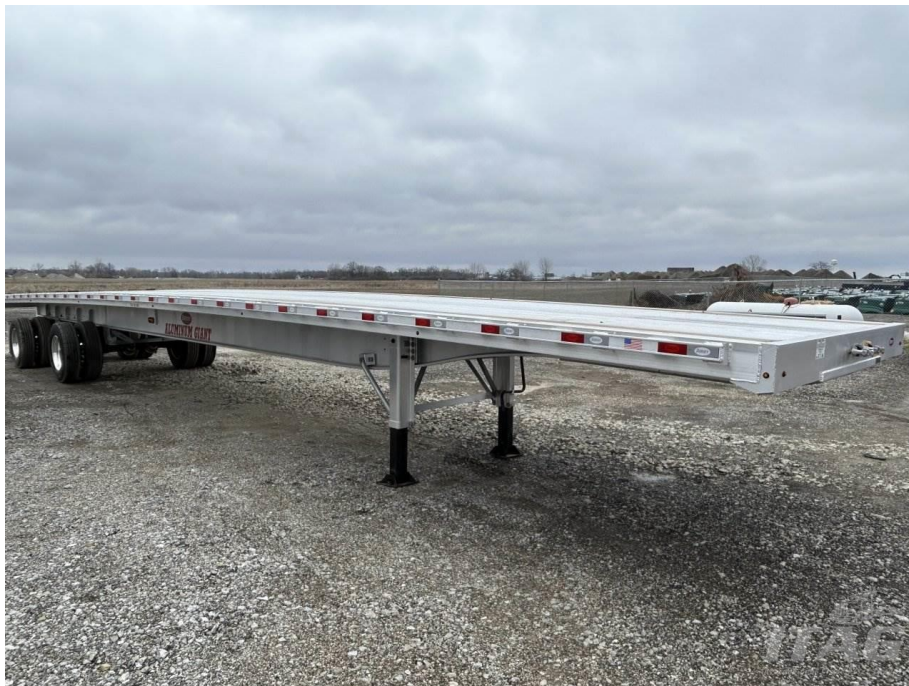
Photo 4. Google image depicting make/model of trailer involved in crash.