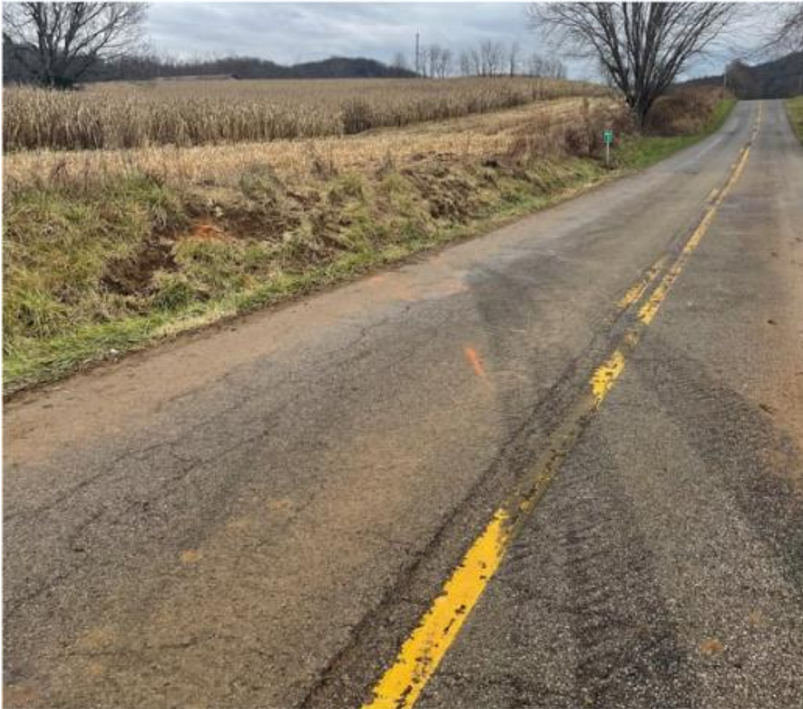
Photo 8. Photo showing yaw marks created by the semi-truck's tires as the truck crossed the north and south bound lanes of travel.

Kentucky Injury Prevention and Research Center Bona fide agent for Kentucky Department for Public Health 333 Waller Avenue, Suite 242 • Lexington, KY 40504 • 859-257-5839