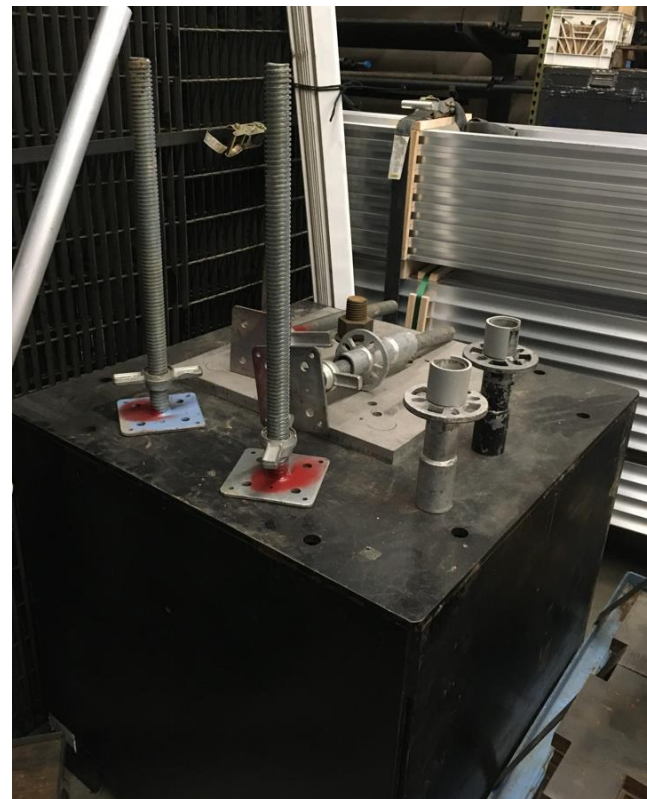
Figure 2 – Ballast weight