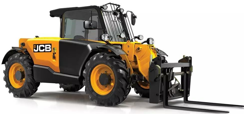
Figure 4 – Telehandler (manufacturer image)

Also involved in the incident was a diesel-powered four-wheel steer/four-wheel drive all-terrain telehandler (Figure 4). This type of equipment is a class 7 rough terrain forklift with variable reach. It had a maximum lifting capacity of 5,500 pounds with the boom retracted. It had a lifting height of 20 feet and a load capacity of 3,900 pounds for vertical lifts. With the boom extended to its full reach of 11.5 feet, the lifting capacity was 1,750 pounds. The vehicle was six feet and two inches tall and six feet wide at its widest point at the tires. The wheelbase was seven feet and ten inches from axle to axle, and the overall length of the base unit was 13 feet and one inch plus the length of any attachment. The telehandler was equipped with a fork attachment.