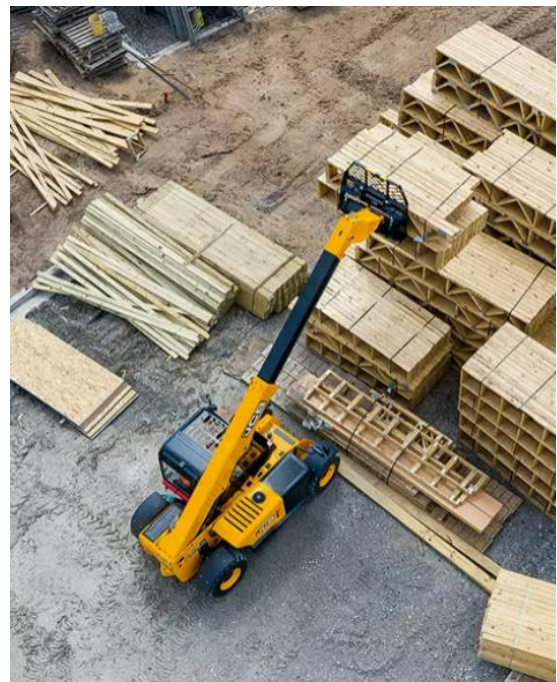
Figure 5 – Telehandler (manufacturer image)

The telehandler had three selectable steering modes: two-wheel steer; four-wheel steer that allowed for tighter turns; and crab steer that allowed for sideways movement.