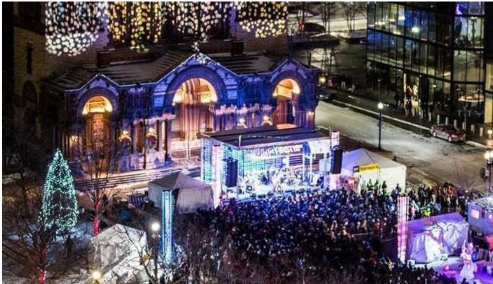
Figure 8 – Stage and venue in use (image from First Night Boston X/Twitter, @firstnight)