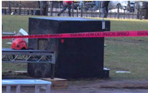
Figure 8 – Ballast weight on its side (scene footage)

ballast off of the victim. A coworker immediately placed a call for EMS. EMS staff arrived within minutes and subsequently pronounced the victim deceased.