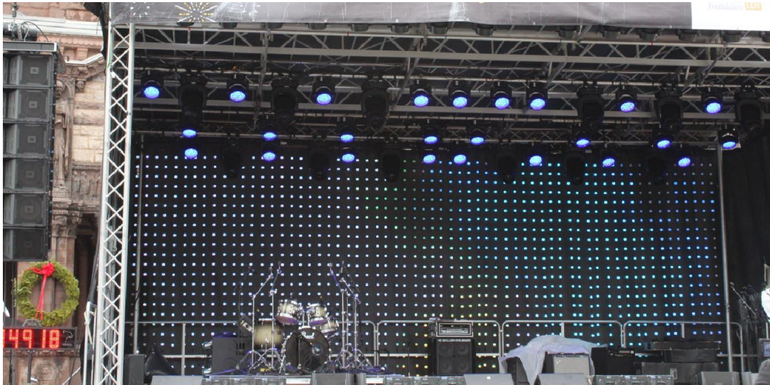
Figure 1 – Stage and rigging with lights