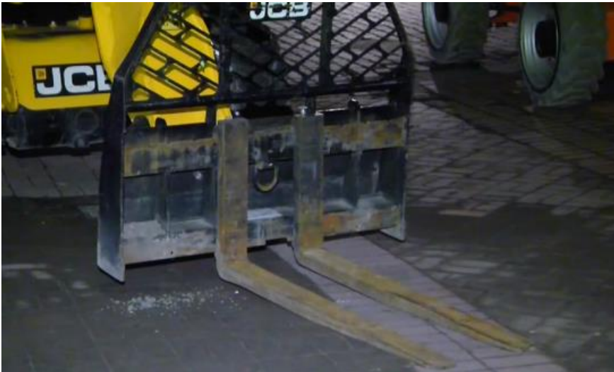
Figure 6 – Telehandler forks and backrest (scene footage)