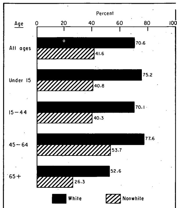
Figure 3. Percent of hospital discharges with some insurance payment for the hospital bill by age and race.

The fraction of the hospital bill paid by insurance by family income is shown in detailed tables 16-18 and is summarized in text table H. As may be seen in table H, for both males and