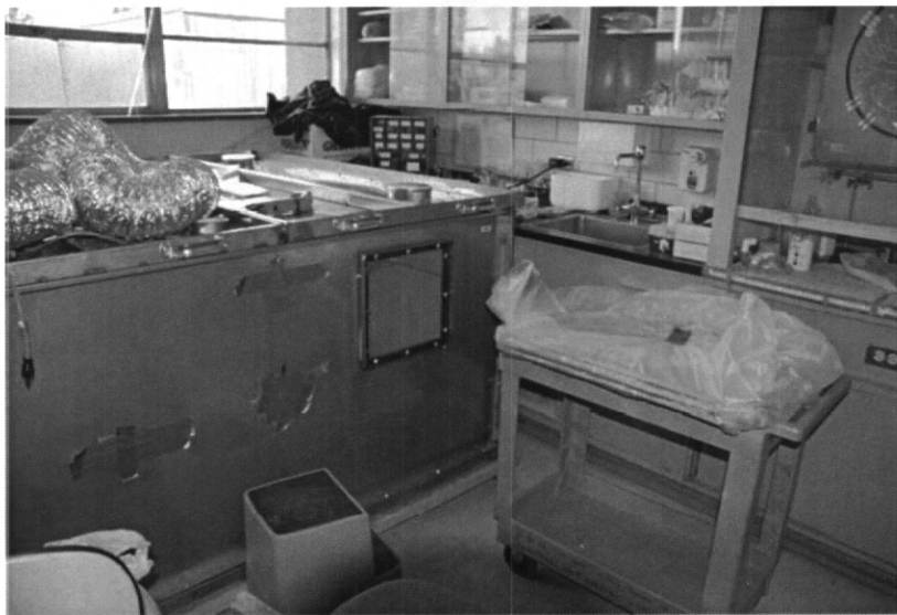
Figure 3. Drywall being removed for transportation to an area to be sampled.

After the material was removed from the chamber, it was placed in a plastic bag and transported to an area to be sampled using three different solvents (methanol, isopropanol, and distilled water).