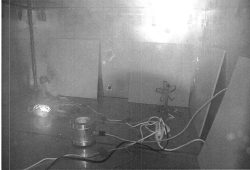
Figure 2. Painted drywall material being contaminated within the chamber.

After the material was removed from the chamber, it was placed in a plastic bag and transported to an area to be sampled using three different solvents (methanol, isopropanol, and distilled water).