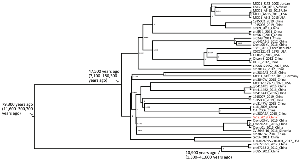
Figure 2. Timed phylogeny in maximum clade credibility tree of Cronobacter sakazakii ST64 strain from a fatal case of necrotizing enterocolitis in a 17-day-old male neonate, China, compared with reference strains. Red text indicates isolate from the neonate. Numbers along branches are bootstrap values. Posterior probabilities are shown in the nodes. ST, sequence type.

The virulence genes in C. sakazakii remain unclear (13), and 2 T6SS and 1 prophage on the chromosome of GZfs might contribute to pathogenicity. The capsular profile of the GZfs was determined to be K1:CA1, as in our previous study (1), and plasmid pFS1 was closely related to the IncFIB-type virulence plasmid pESA3 identified in pathogenic C. sakazakii strains and pGW2 in C. sakazakii GZcsf-1, which causes