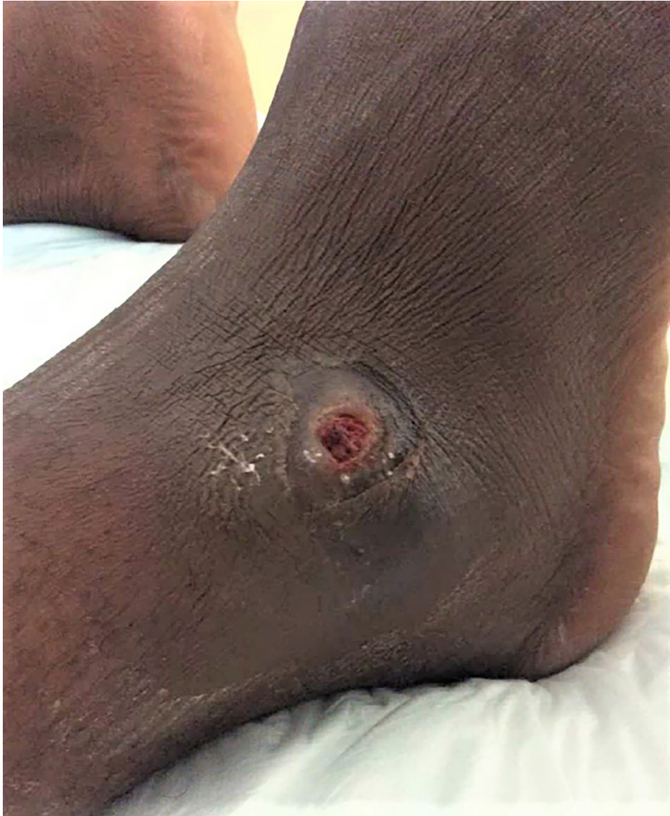
Appendix Figure. Image of right ankle cutaneous ulcer from patient with Corynebacterium diphtheriae species complex infection, Réunion Island, France, 2015–2020.