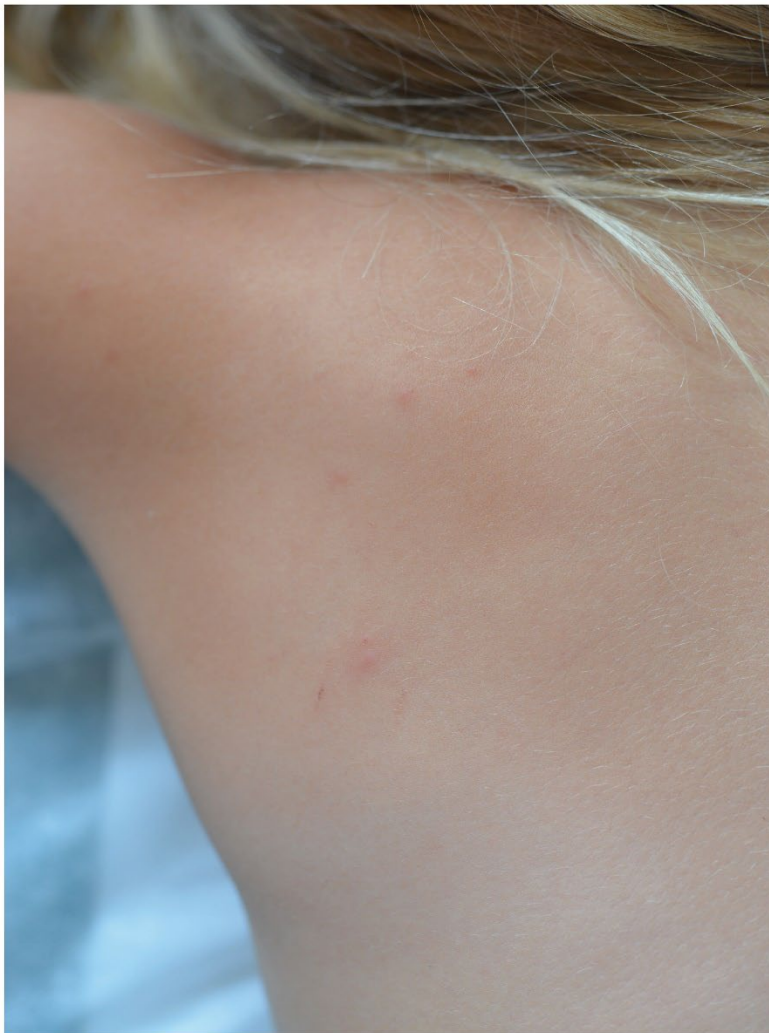
Appendix Figure 1. Micropapular pustule over a discreet erythematous basis similar to a mosquito bite, August 9, 2022.