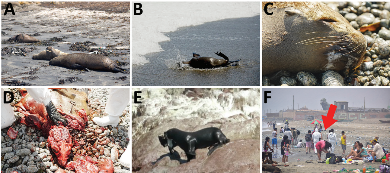
Figure. Sea lion deaths and investigation associated with outbreak of highly pathogenic avian influenza A(H5N1) in Paracas National Reserve, Peru, on the coastline, February 2023. A) Sea lion carcasses on the beach. B) Dying sea lion with ataxia. C) Dead sea lion with avian influenza clinical signs (whitish secretions). D) Sea lion necropsy showing a congestive brain. E) Sea lion trapping and eating a sick guanay cormorant, January 23, 2023. F) Field work sampling on a beach with a large number of bathers in the surroundings of infected carcasses. Red arrow indicates study staff wearing health protection equipment conducting field survey.

Further research is required to confirm the HPAI H5N1 virus as the main factor affecting the sea lions and to address the transmission pathway in this social species. We call for more attention to human–infected animal interaction in this geographic region (Figure, panel F) to identify any rise in infections and prevent a new pandemic.