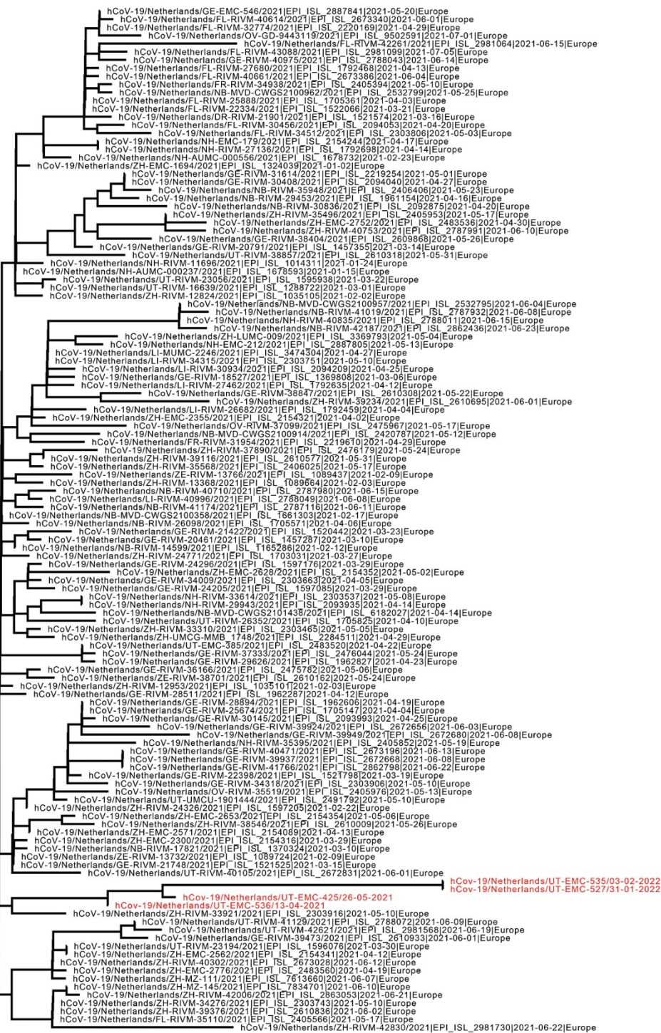
Appendix Figure 1. Zoom of the phylogenetic analysis of all downsampled SARS-CoV-2 Alpha variants (B.1.1.7) in the Netherlands. The sequences from the same long-term infected person are depicted in red. Scale bar indicates number of substitutions per site.