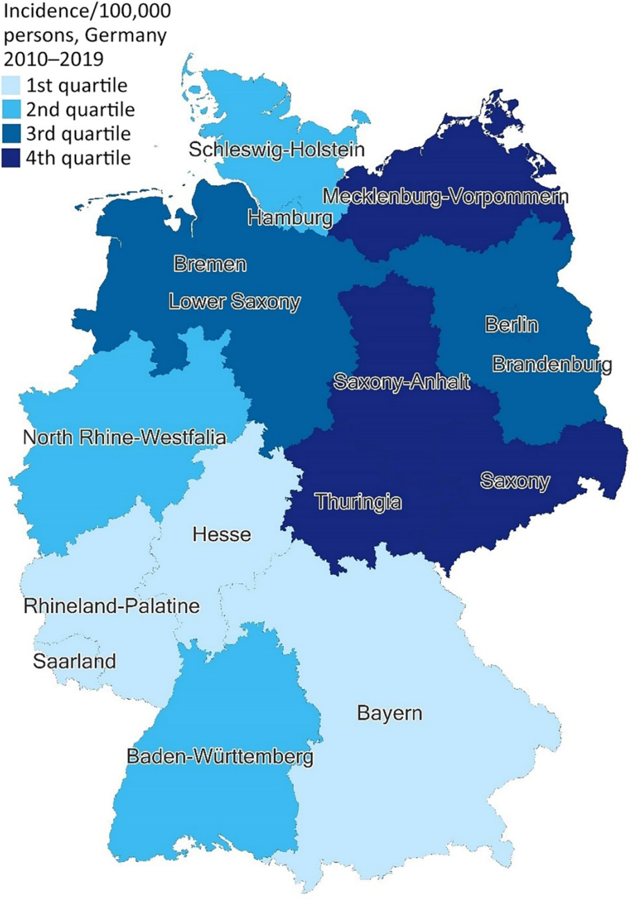
Appendix Figure. Spatial distribution of average annual incidence of pregnancy-associated and non-pregnancy associated listeriosis in federal states, Germany, 2010–2019 (n = 5,575)