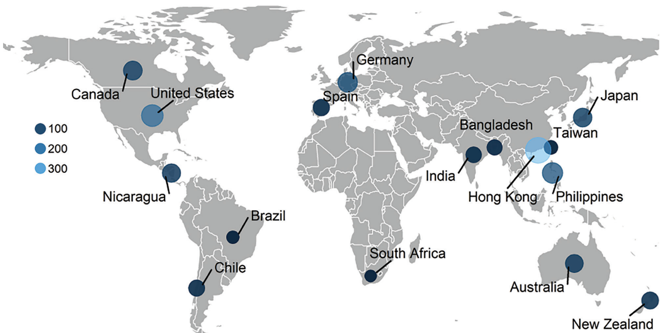
Figure 1. Countries participating in NoroSurv, September 2016–August 2020. Shades of blue and size of circles indicate the number of genetic sequences included from each country.

Throughout the study period, GII.4 Sydney was the most common genotype on all 6 continents and was detected in 52% (687/1,325) of sequences, peaking at 62% (213/343) in 2019–2020 (Figure 2; Appendix Table 1, https://wwwnc.cdc.gov/EID/article/27/5/20-4756-App1.pdf ). The GII.3 (190; 14%), GII.2 (149; 11%), and GII.6 (64; 5%) genotypes comprised 30% of sequences (Figure 2; Appendix Table 1). GI.3 was the most frequently detected GI genotype, accounting for 55% (50/91) of all GI viruses and 4% of all NoroSurv sequences. The remaining 14% (185/1,325) of sequences were composed of 17 other genotypes: GI.1, GI.2, GI.4, GI.5, GI.6, GI.7, GI.9, GII.1, GII.4 Hong Kong, GII.4 untypable, GII.7, GII.8, GII.12, GII.13, GII.14, GII.17, and GII.20 (Appendix Table 1). We detected 687 GII.4 Sydney viruses associated with 3 P-types: P16 (399; 58%), P31 (280; 41%), and P4 (8; 1%). The proportions of each genotype varied by year (Figure 2; Appendix Table 1) and country (Appendix Tables 2–17). The most