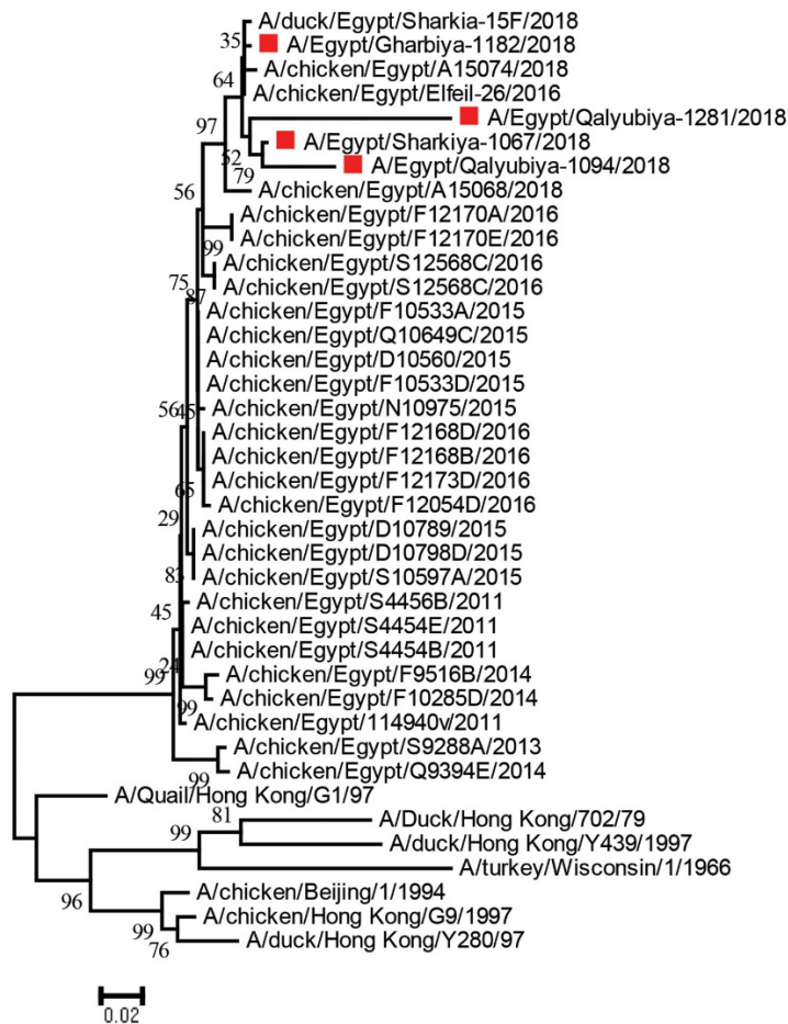
Appendix Figure 1. Phylogenetic analysis of the hemagglutinin gene of H9N2 viruses from infected cases (red squares). Those viruses belonged to G1-like viruses endemic in Egypt