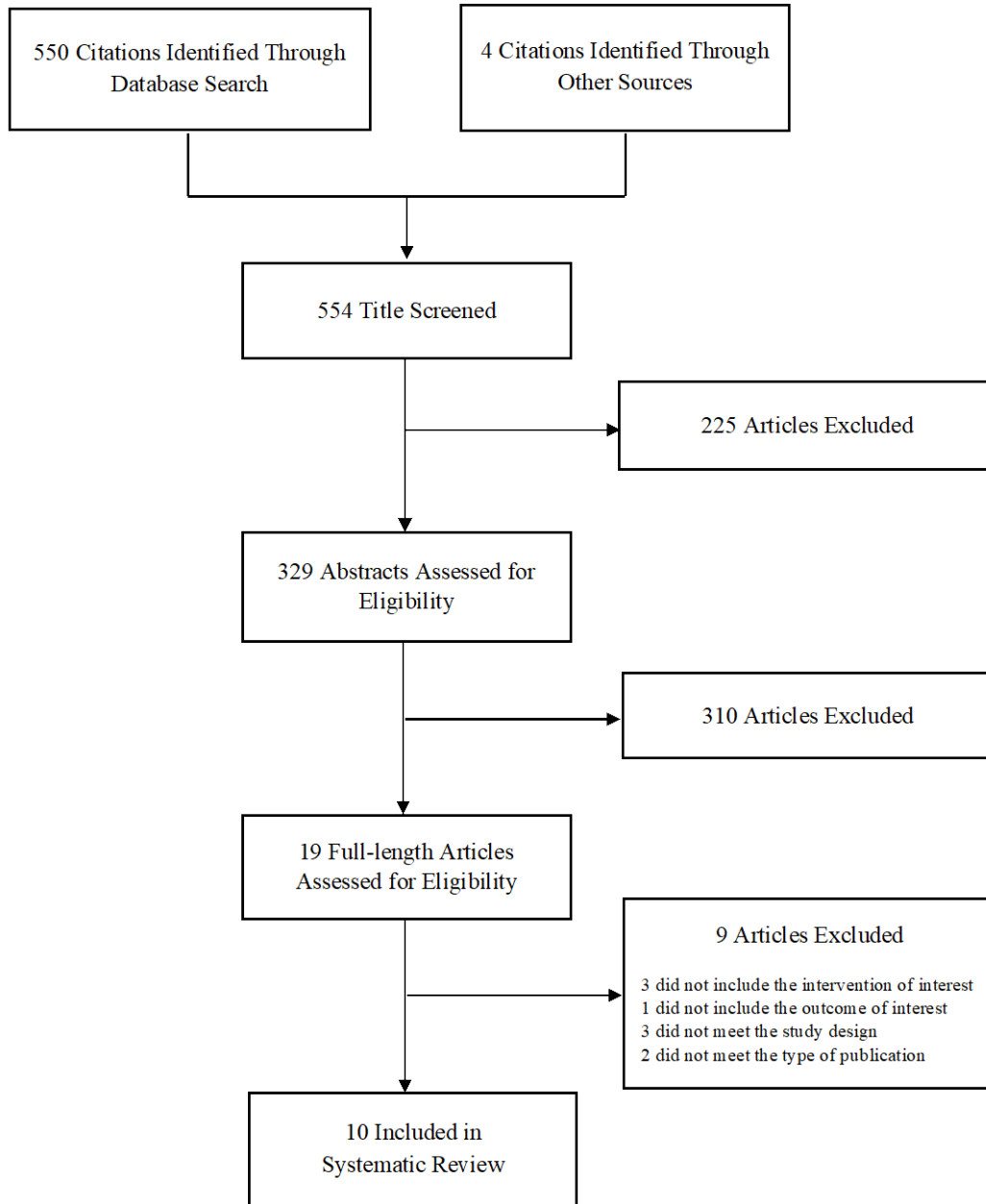
Appendix Figure 2. Flowchart of literature search and study selection for international travel restriction.