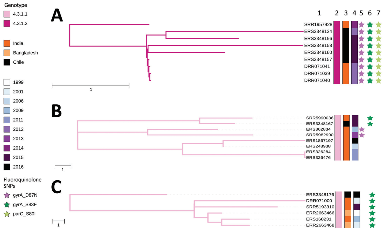
Figure 2. Nearest-neighbor calculations of Salmonella enterica serovar Typhi of genotype 4.3.1 and maximum-likelihood phylogenetic trees for 3 introductions of Salmonella Typhi genotype 4.3.1 into Chile in the context of their closest Salmonella Typhi isolate neighbors. A) Isolate collected during 2012–2014 resembles isolates from South Asia. B) Isolate collected during 2015 resembles isolates from India. C) Isolate collected in 2016 is closely related to a cluster of sequences from India and Bangladesh. Accession numbers, genotypes, countries, and years of isolation are shown. Stars indicate mutations in the quinolone resistance determining region of genes gyrA , gyrA -S83F and gyrA -D87N, and parC -S80I. Scale bars indicate SNP distance. SNP, single-nucleotide polymorphism.

infer maximum likelihood phylogenies and specified a generalized time-reversible model and a Gamma distribution to model site-specific rate variation by using GTRGAMMA in RAxML version 8.2.9 ( https://github.com/stamatak/standard-RAxML ) and 100 bootstrap pseudoreplicates to assess branch support. SNP distances were calculated by using snp-dists ( https://github.com/tseemann/snp-dists ; Appendix 2). Raw Illumina reads were assembled by using either Velvet version 1.2 (European Bioinformatics Institute, https://www.ebi.ac.uk/~zerbino/velvet ) or Unicycler version 0.4.7 (10). Assembled reads were input into Pathogenwatch ( https://pathogen.watch ) to detect nonsynonymous mutations in the quinolone-resistance determining region of gyrA and parC genes responsible for reduced fluoroquinolone susceptibility. We also used this approach to look for known antimicrobial resistance (AMR) genes. We further screened the sequences from Chile and close genetic relatives to determine molecular determinants of AMR and known plasmid replicon genes (Appendix 1 Table).