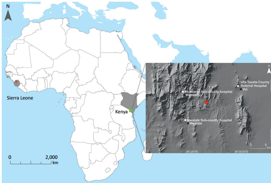
Figure 1. Locations of Bombali Ebola virus infection in Sierra Leone (gray shading at left; Bombali district in red) and Kenya (gray shading at right; Taita Hills area in green). Inset map shows collection site of the Bombali virus-positive bat (red dot) in Kenya, clinics in which human serum samples were collected (white squares), and the closest towns (black squares).

(7). However, further monitoring of M. condylurus and C. pumilus bats and other sympatric species across Africa is required to support this hypothesis.