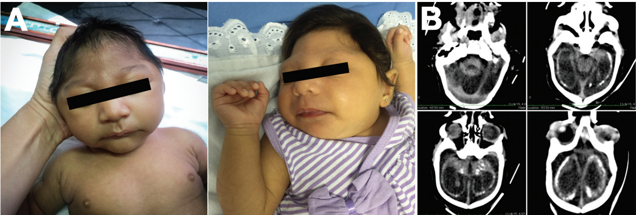
Figure 2. Microcephaly, Pernambuco State, Brazil, 2015. A) Two newborns in whom microcephaly was diagnosed during the epidemic. B) Brain computed tomography scan of a 43-day-old infant showing cerebellar hypoplasia, parenchymal calcifications, ventriculomegalia, and malformation of cortical development compatible with lissencephaly.

Pernambuco since December 2015, supported by the Brazilian Ministry of Health and the Pan American Health Organization, to establish an association between microcephaly and Zika virus (primary hypothesis) and explore other infectious or noninfectious causes.