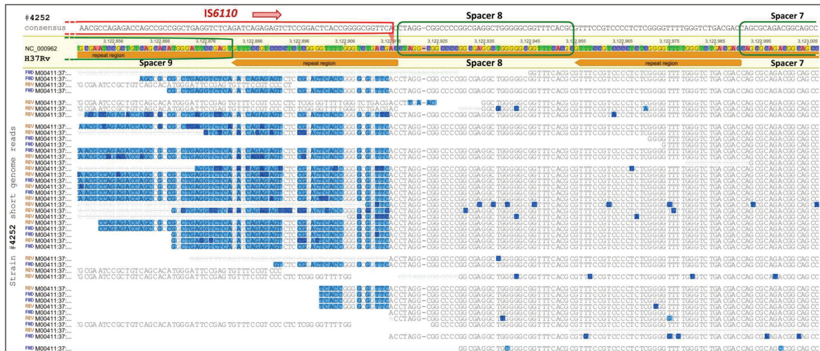
Technical Appendix Figure. Whole-genome, short-sequencing reads of Mycobacterium tuberculosis strain 4542 mapped to complete genome of reference strain H37Rv (NC_00962.3) by using Geneious 9.0 package: genome locus of spacers 7–9 in DR/CRISPR locus. Spacer numbers are given according to 43-spoligotyping (1). DR/CRISPR locus in M. tuberculosis is located on complementary strand, whereas spacers are consecutively numbered within the locus, not genome. Such a situation (IS6110 asymmetrically inserted in the direct repeat unit immediately adjacent to a spacer) was discovered by Filliol et al. (2).