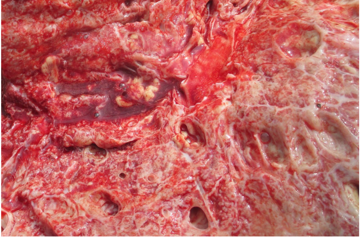
Technical Appendix Figure 2. Granulomatous tuberculosis lesion with caseous mass in lungs.