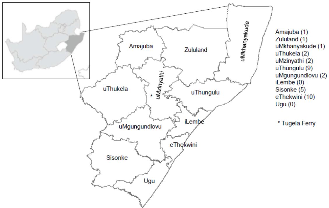
Technical Appendix Figure 1. Isolates sequenced from KwaZulu-Natal (KZN), South Africa, with number from each district sampled as part of KZNSUR project. Inset: Map of South Africa with KZN shaded