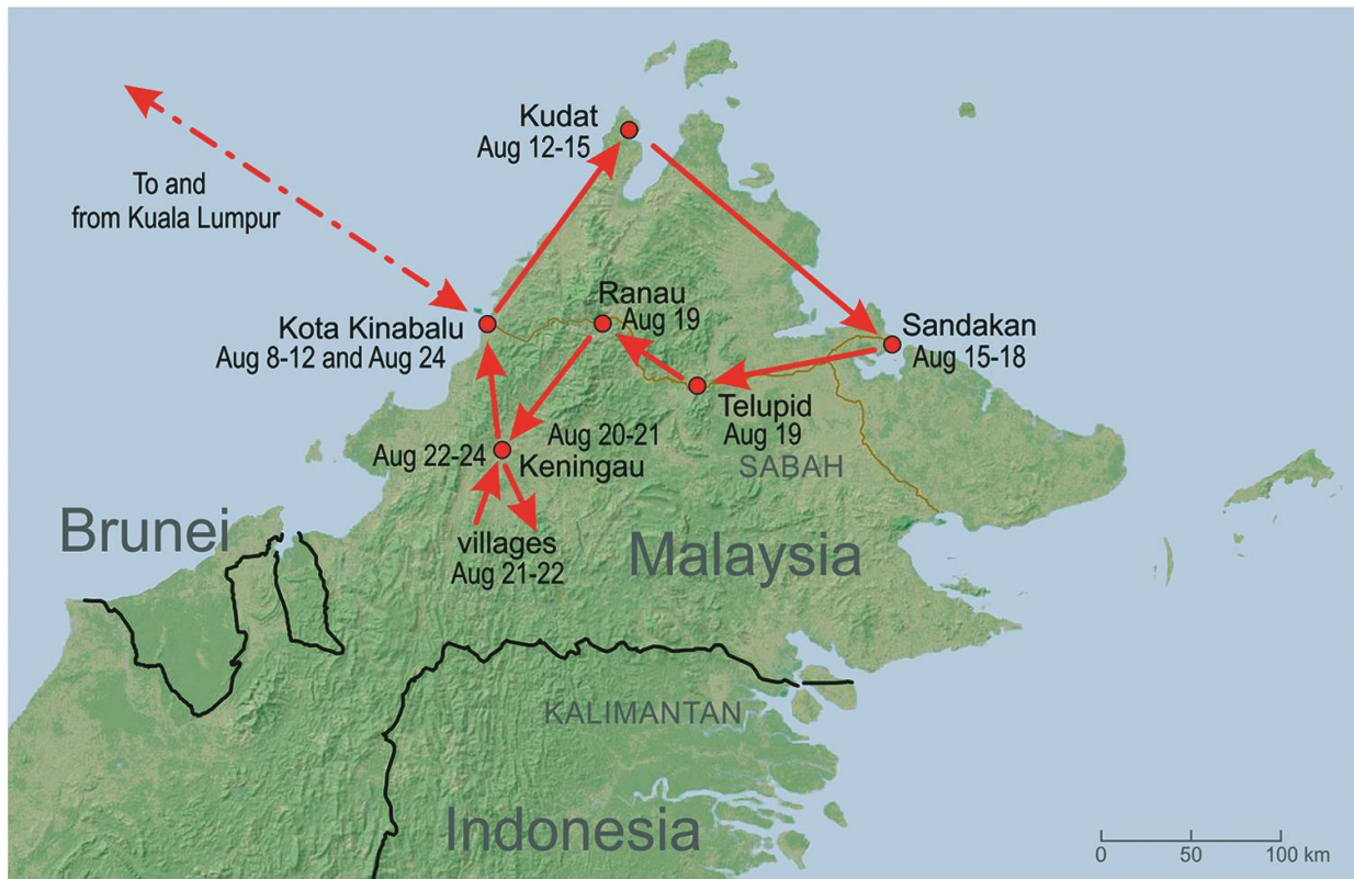
Technical Appendix Figure. Map of northern Borneo showing the itinerary through the Malaysian state of Sabah of a patient with Zika fever. The patient most likely became infected while staying in Keningau and southern villages (Papalungan), where she also took a boat trip on the Sungai Papalungan, a river through the rain forest.