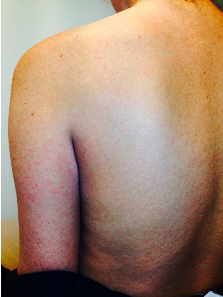
Technical Appendix legend. Maculopapular rash on the trunk and extremities of a patient with Zika virus infection imported from Tahiti, French Polynesia, December 2013.