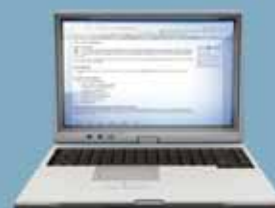
Table of contents Podcasts Ahead of Print CME Specialized topics