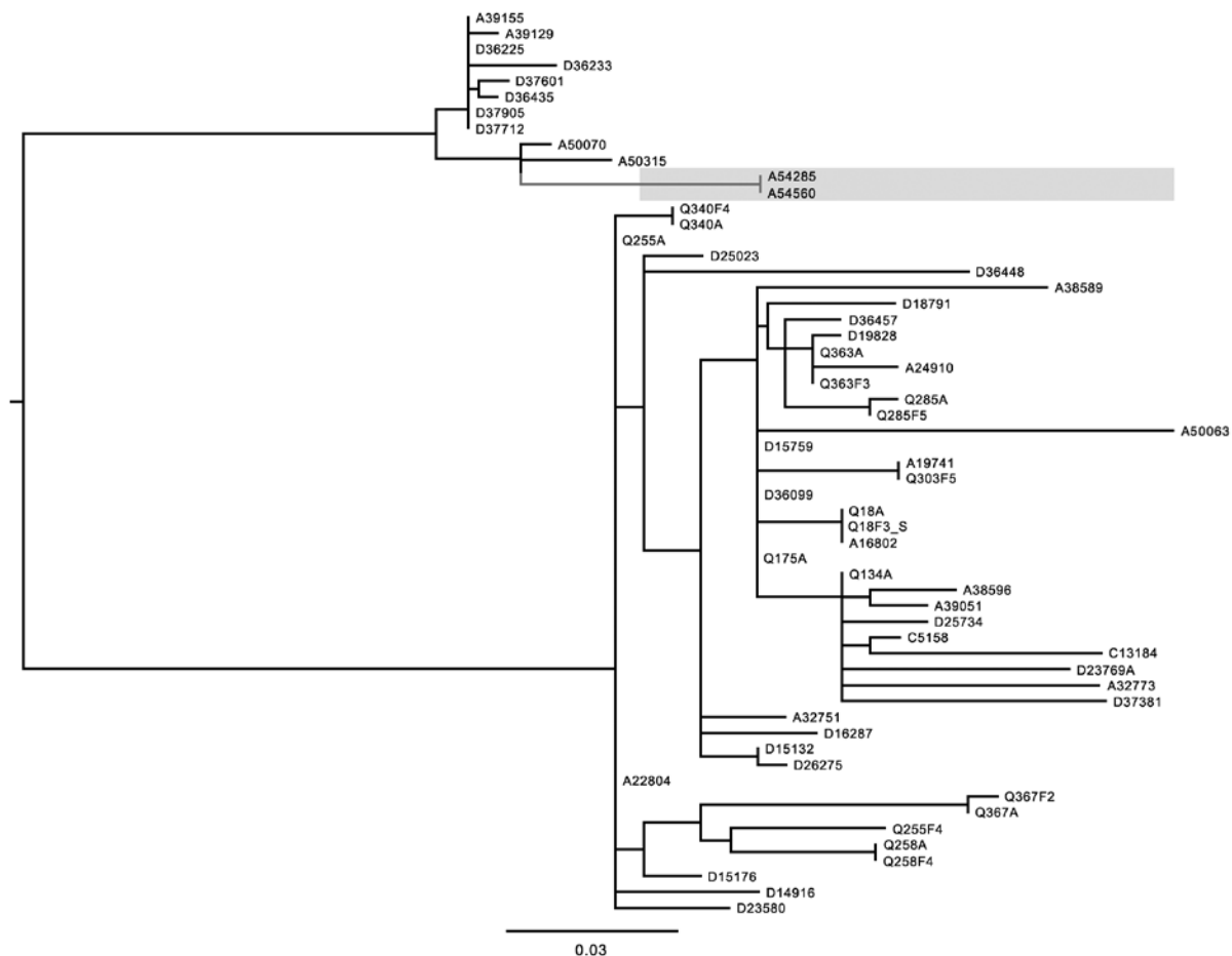
Figure. Midpoint-rooted phylogenetic tree of published whole-genome sequence data from D23580-like Salmonella enterica serotype Typhimurium sequence type 313s from Malawi based on 204 informative single-nucleotide polymorphisms. A54285 and A54560, highlighted in gray, are indistinguishable. Scale bar indicates nucleotide substitutions per site.

These data confirm the presence of an extended-spectrum \beta -lactamase (ESBL)-producing IncHI2 plasmid in strain A54560 that is capable of conjugative transfer and suggest that the plasmid might have been acquired by residual index strain within the patient by transfer from an unknown donor