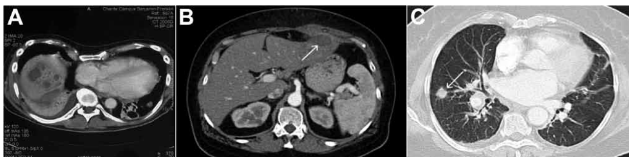
Figure. Pretreatment computed tomography images of patients with Klebsiella pneumoniae liver abscesses. A) Multilobular abscess in segment 8 of the liver and pleural effusion in 48-year-old white man (patient 1). B) Liver abscess (arrow) in 71-year-old white woman with type-2 diabetes (patient 2). C) Lung lesion (arrow) in patient 2.

These 2 cases of community-acquired K. pneumoniae serotype K1 and K2 liver abscesses with metastatic spread to the lung and urinary systems