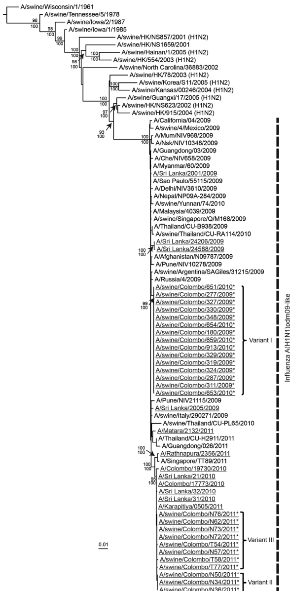
Figure 2. Phylogenetic relationship of the hemagglutinin 1 gene of the human and swine influenza A(H1N1)pdm09-like viruses isolated during 2009–2012 in Sri Lanka. Underlining indicates swine and human viruses characterized in this study; *indicates swine A(H1N1)pdm09 virus isolates. Nucleotide sequences from selected, related avian, equine, swine, and human virus strains available in GenBank are included for comparison. The phylogenetic tree was generated by the maximum-likelihood method and rooted to A/duck/Miyagi/66/77(H1N1) virus (online Technical Appendix 1, wwwnc.cdc.gov/EID/article/19/3/12-0945-Techapp1.pdf ). Scale bar represents number of nucleotide substitutions per site. Vertical dashed line indicates influenza A(H1N1)pdm09-like virus lineage. Branch labels record the stability of the branches >500 bootstrap replicates. Numbers above and below branches indicate neighbor-joining bootstrap values and Bayesian posterior probabilities, respectively. Only bootstrap values >70% and Bayesian posterior probabilities >95% are shown. Three genetic variants with >1 aa difference in hemagglutinin 1 are indicated.

corresponding waves of swine infections, and each lineage that occurred in swine led to extinction (online Technical Appendix 2, wwwnc.cdc.gov/EID/article/19/3/12-0945-Techapp2.pdf ). This finding suggests that the A(H1N1)pdm09 infections among swine that occurred during January–February 2011 were separate spillover events from the second wave of human infections during October 2010–February 2011 rather than from continued epizootic transmission among swine from October 2009. The upper 95% CI of the prevalence of each viral genetic variant, given no positive isolates since the last detection, declined to almost zero during the course of observation, indicating probable extinction of these genetic variants (online Technical Appendix 2).